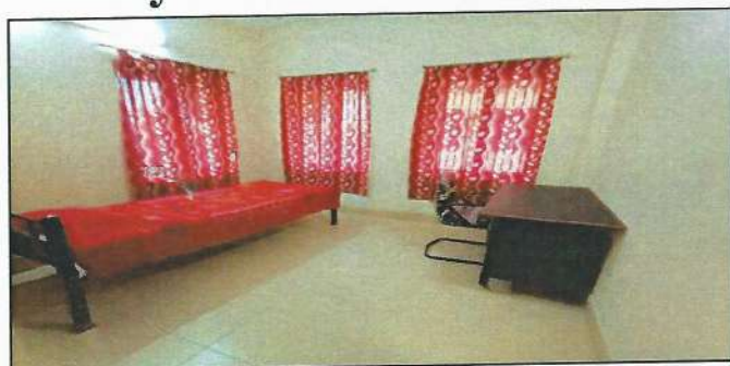
BED ROOM 1