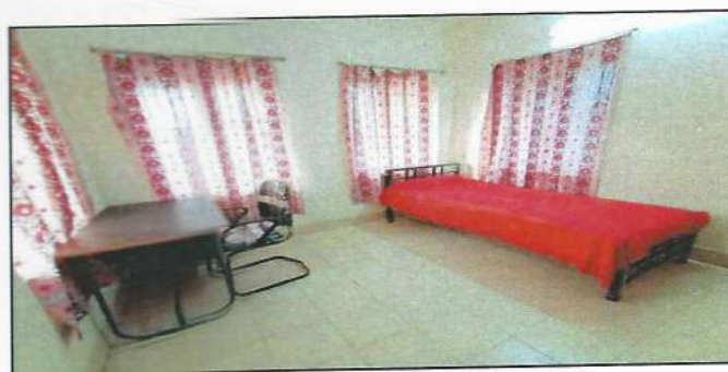
BED ROOM 2