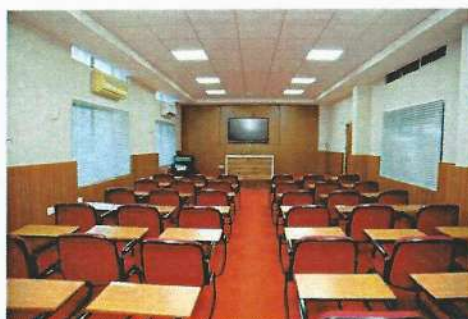
Smart Class Room