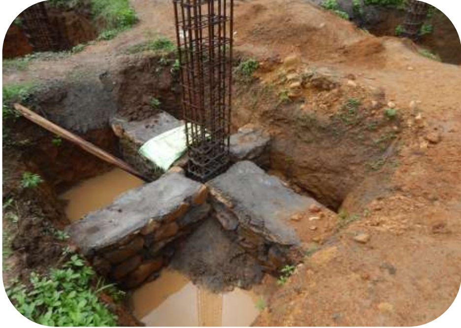
View of Footing