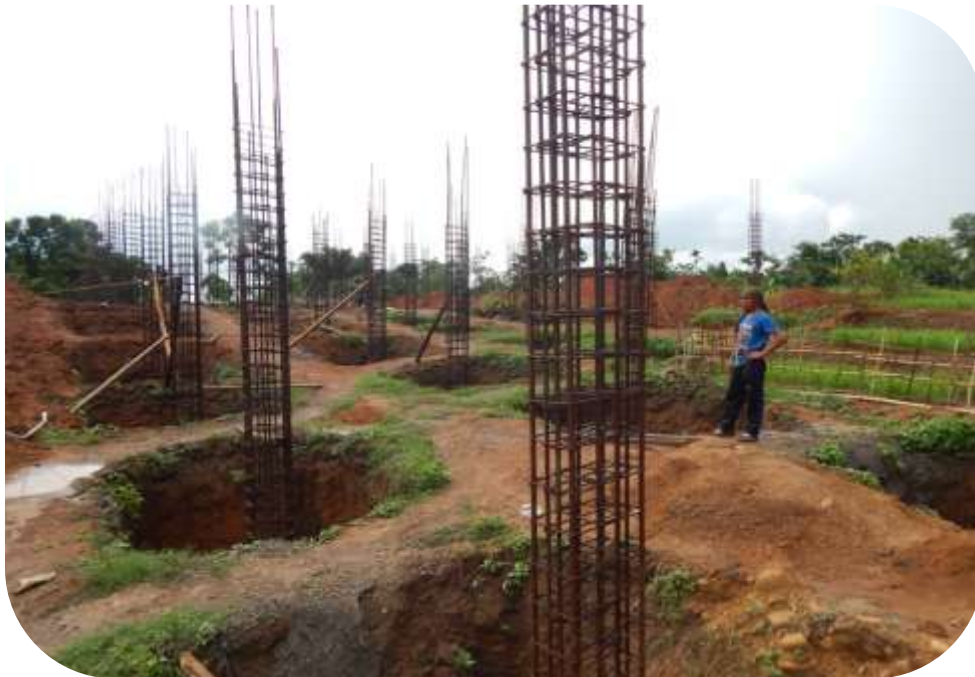
View of site