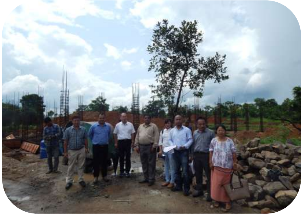
Nec officials with Implementing department at project site.