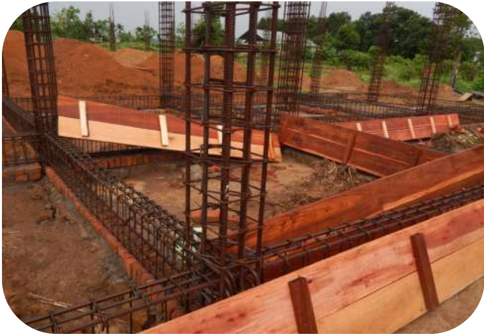
View of reinforcement used