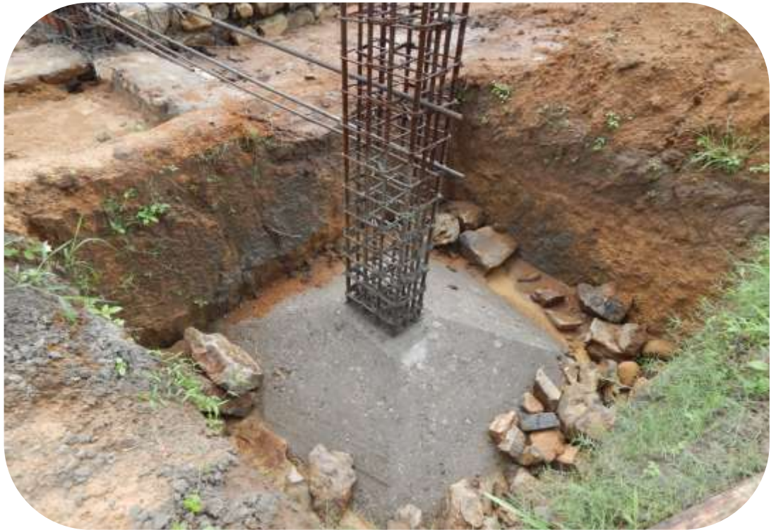
View of foundation