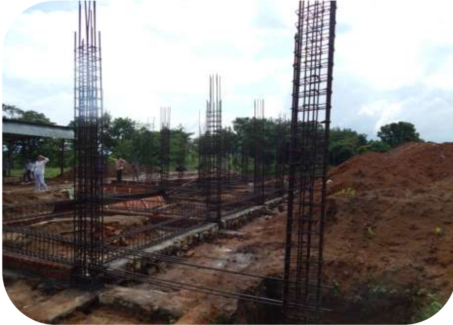
View of Columns and tie beam reinforcement