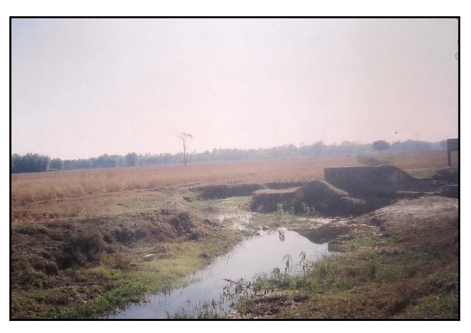
Kekurajuli GC cum Water Distribution Project