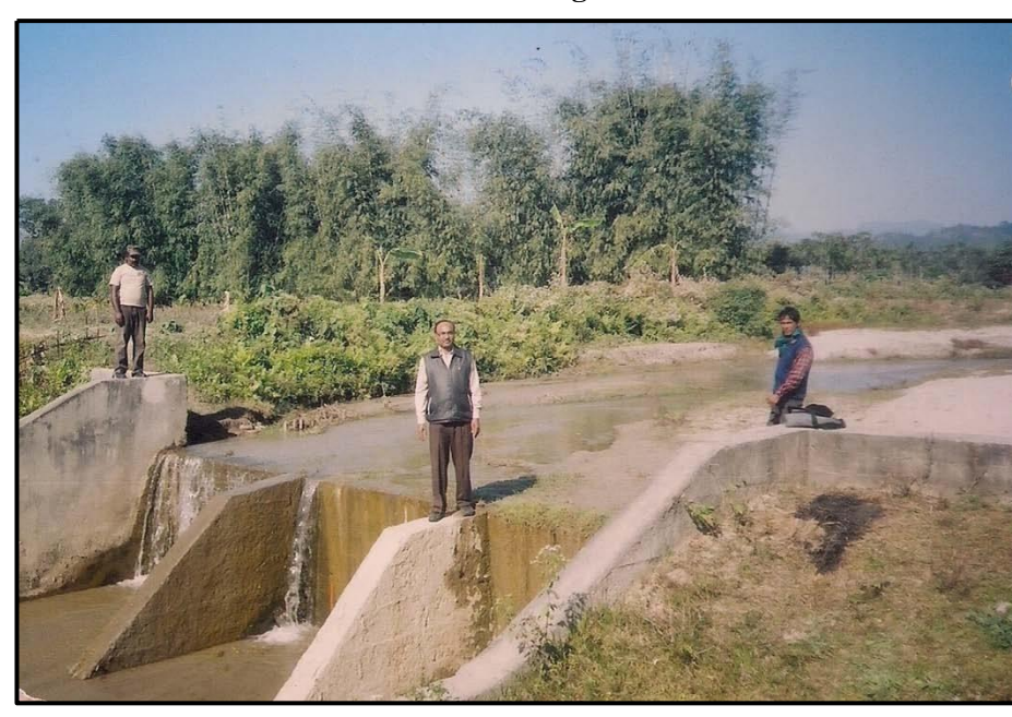
Saru-Aamloga GC cum Water Distribution Structure