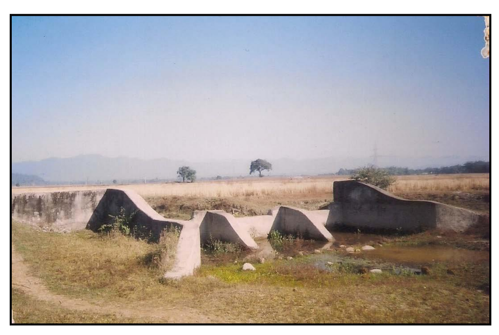
Water Harvesting Structure across Kekurajuli stream