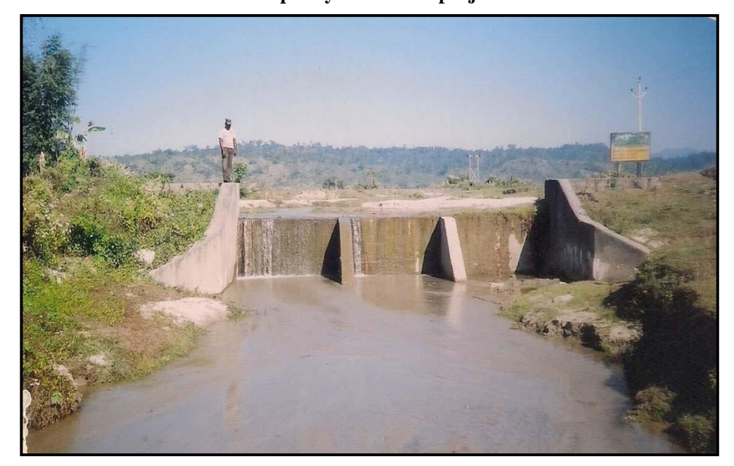
Saru-Aamloga GC cum Water Distribution Structure