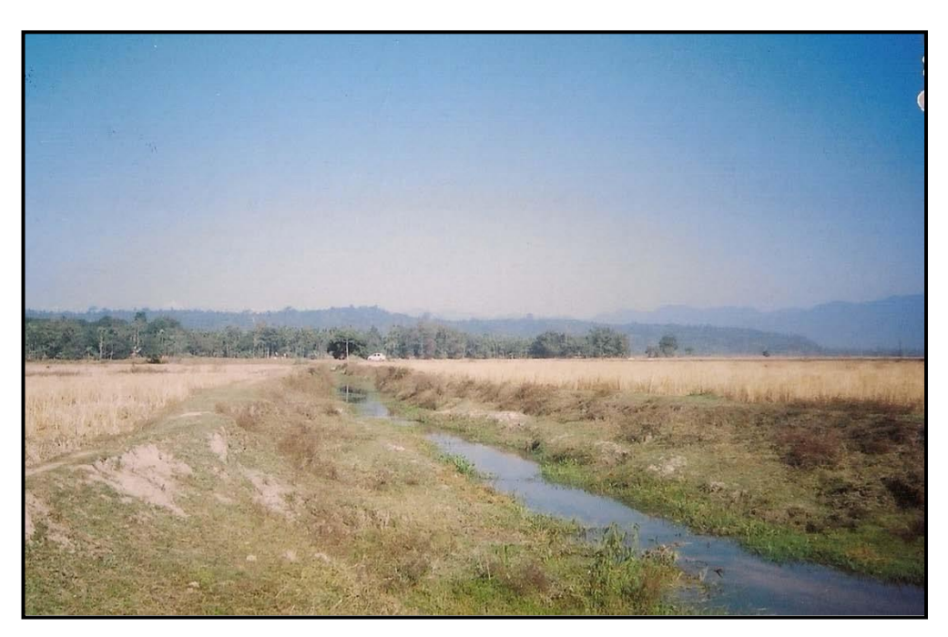
View of the paddy field at the project site