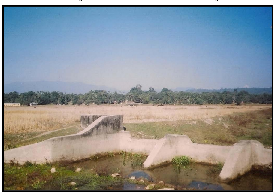
Detail Downstream View of Kekurajuli Water Harvesting Structure