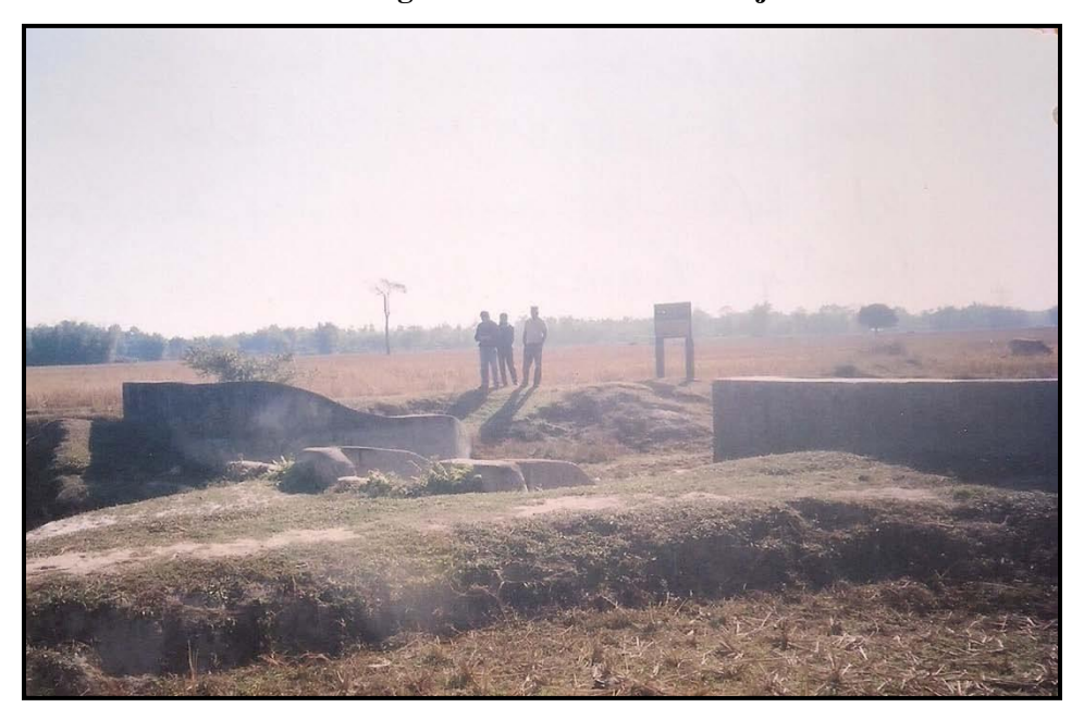
Kekurajuli GC cum Water Distribution Project