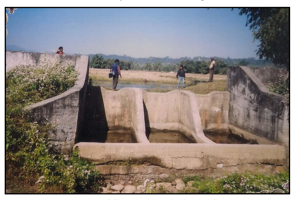
Barkhapur GC cum Water Distribution Structure