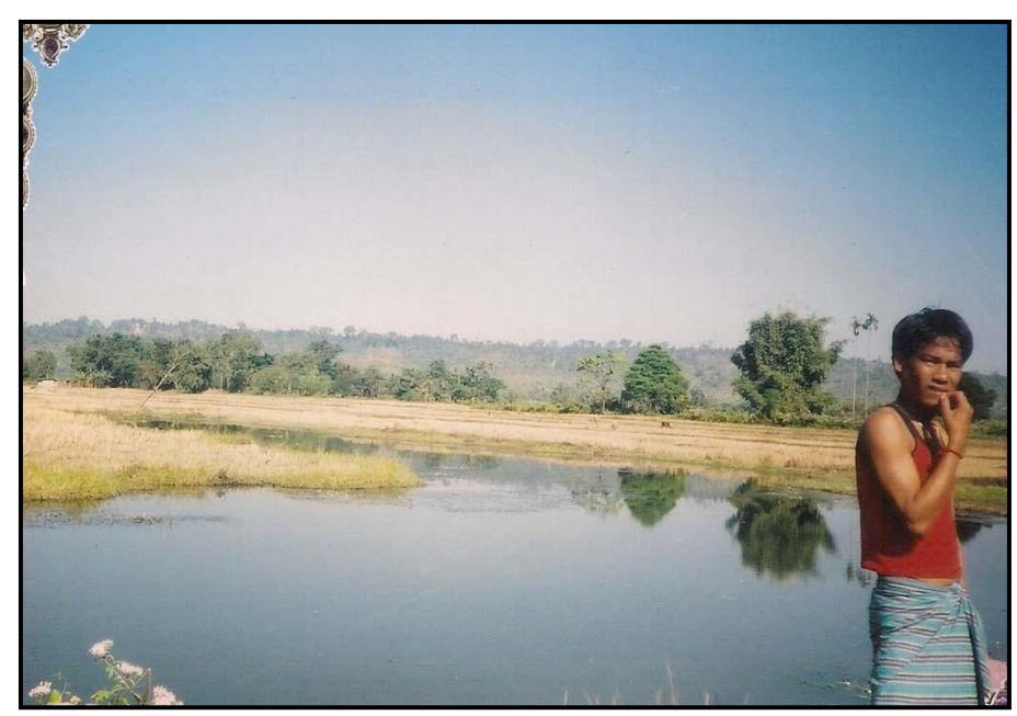
Water body suitable for fishery