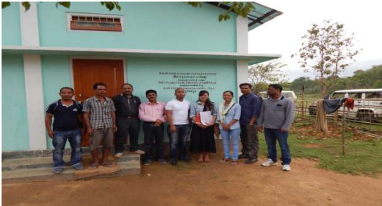
Inspection team in front of Multi Utility Facility Centre