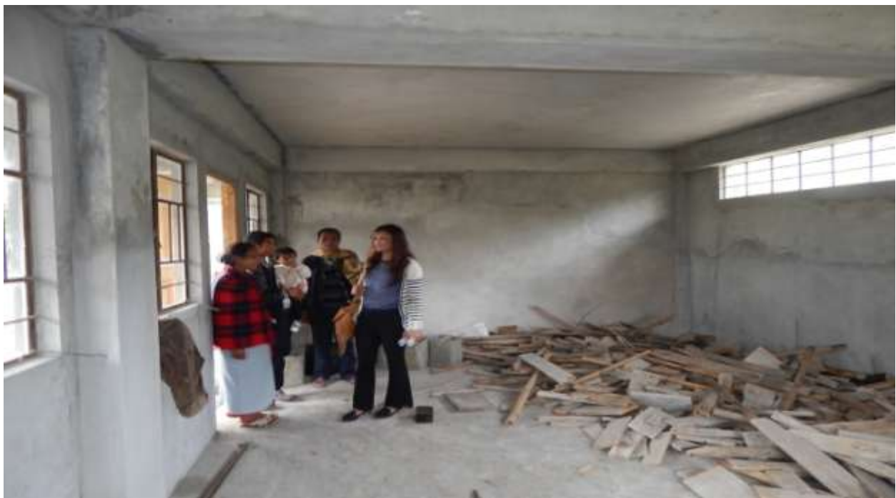
Inside view of Rongram Multi Utility Facility Centre at Mawthawbtah Village