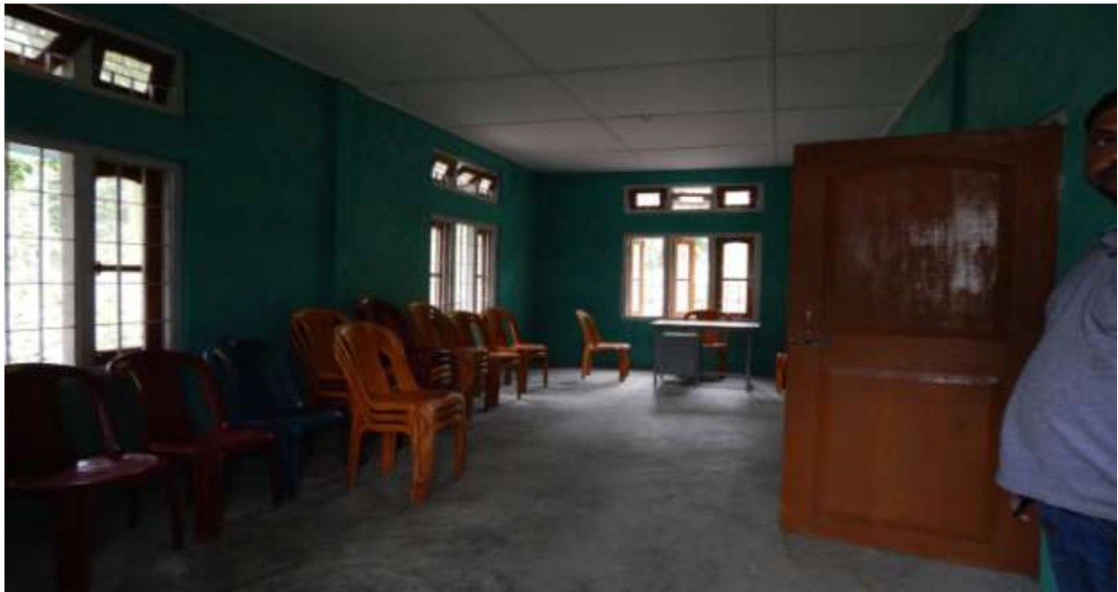
Inside view of Rongram Multi Utility Facility Centre at Bandrikona Village