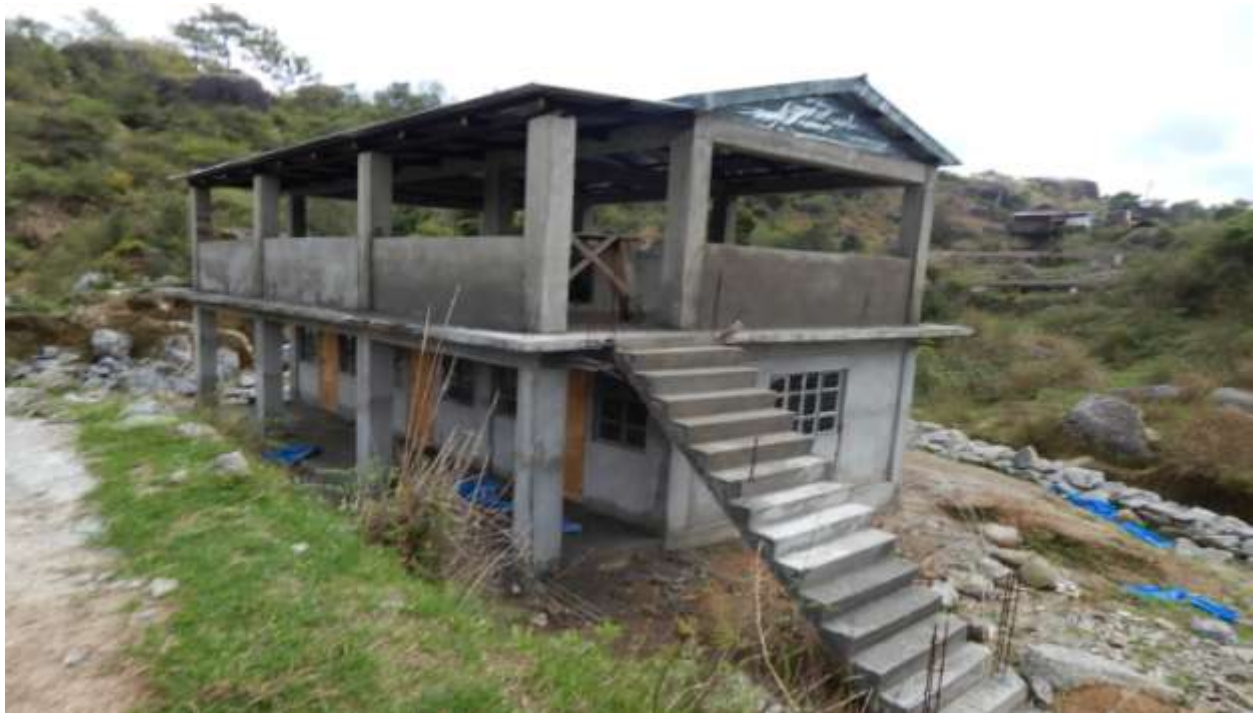
View of of Rongram Multi Utility Facility Centre at Mawthawbtah Village