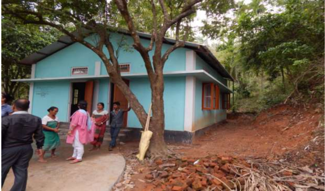
View of of Rongram Multi Utility Facility Centre at Bandrikona Village