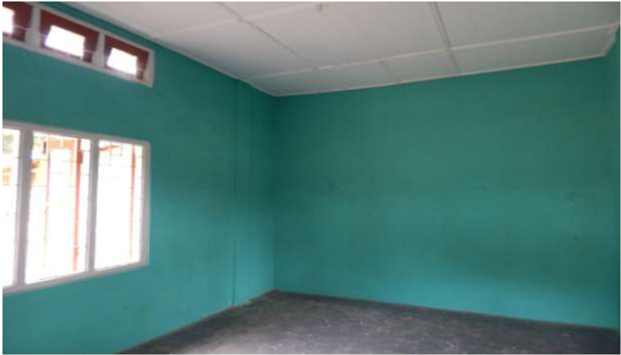
Inside view of Multi Utility Facility Centre at West Khasi Hills