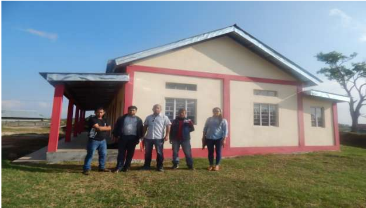
Inspection team in front of Multi Utility Facility Centre