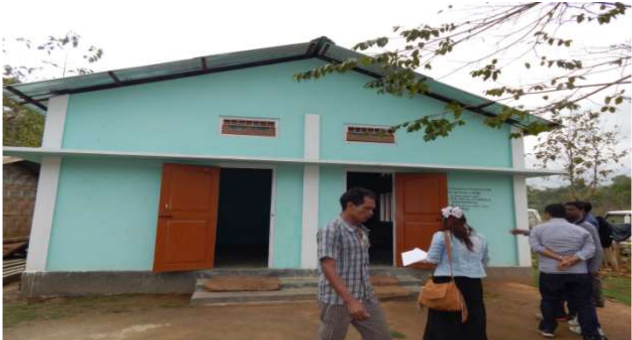
View of Multi Utility Facility Centre at West Khasi Hills