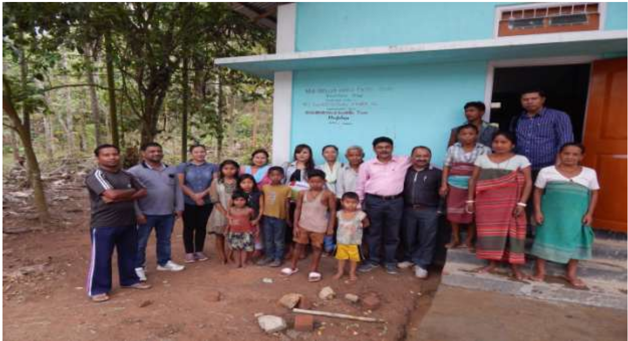
Inspection team with the beneficiaries in front of Rongram Multi Utility Facility Centre