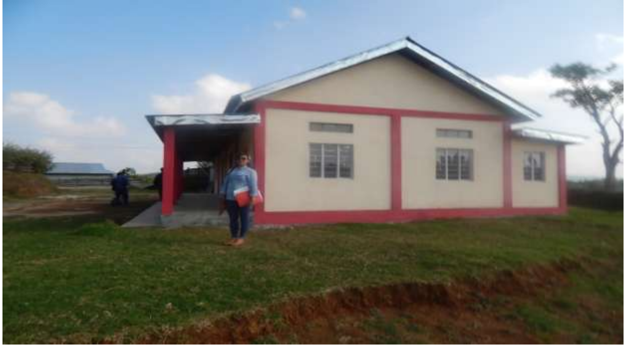
View of of Multi Utility Facility Centre