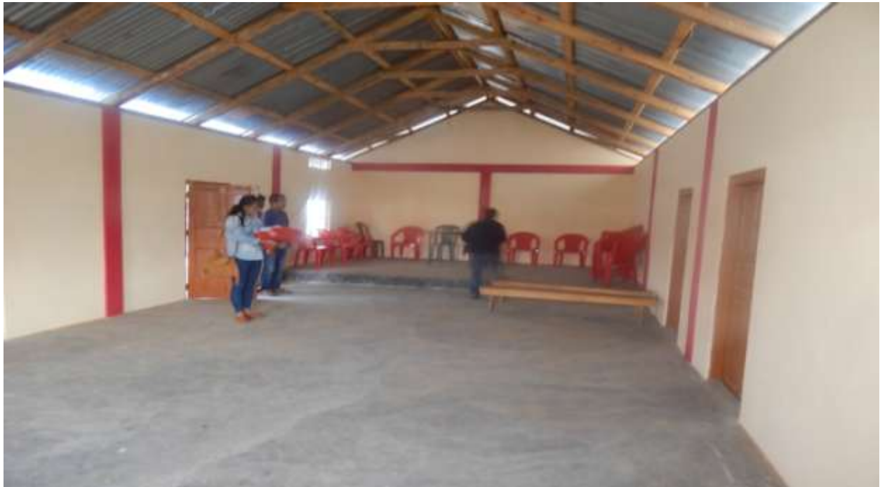
Inside view of Multi Utility Facility Centre