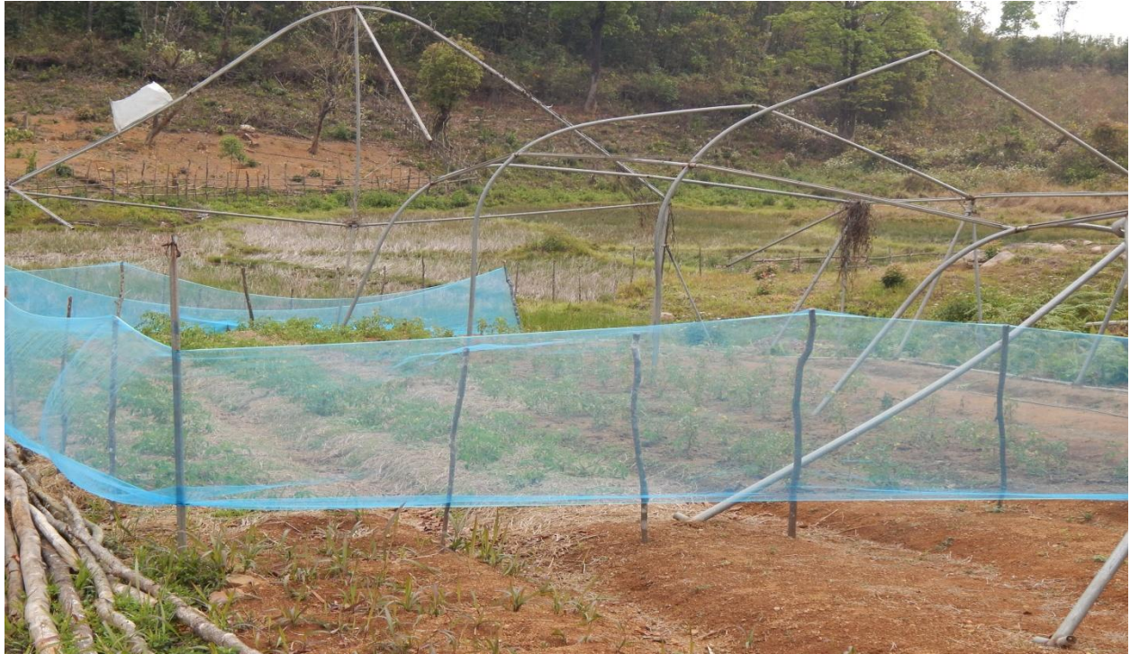
View of Vegetables grown in damage green house