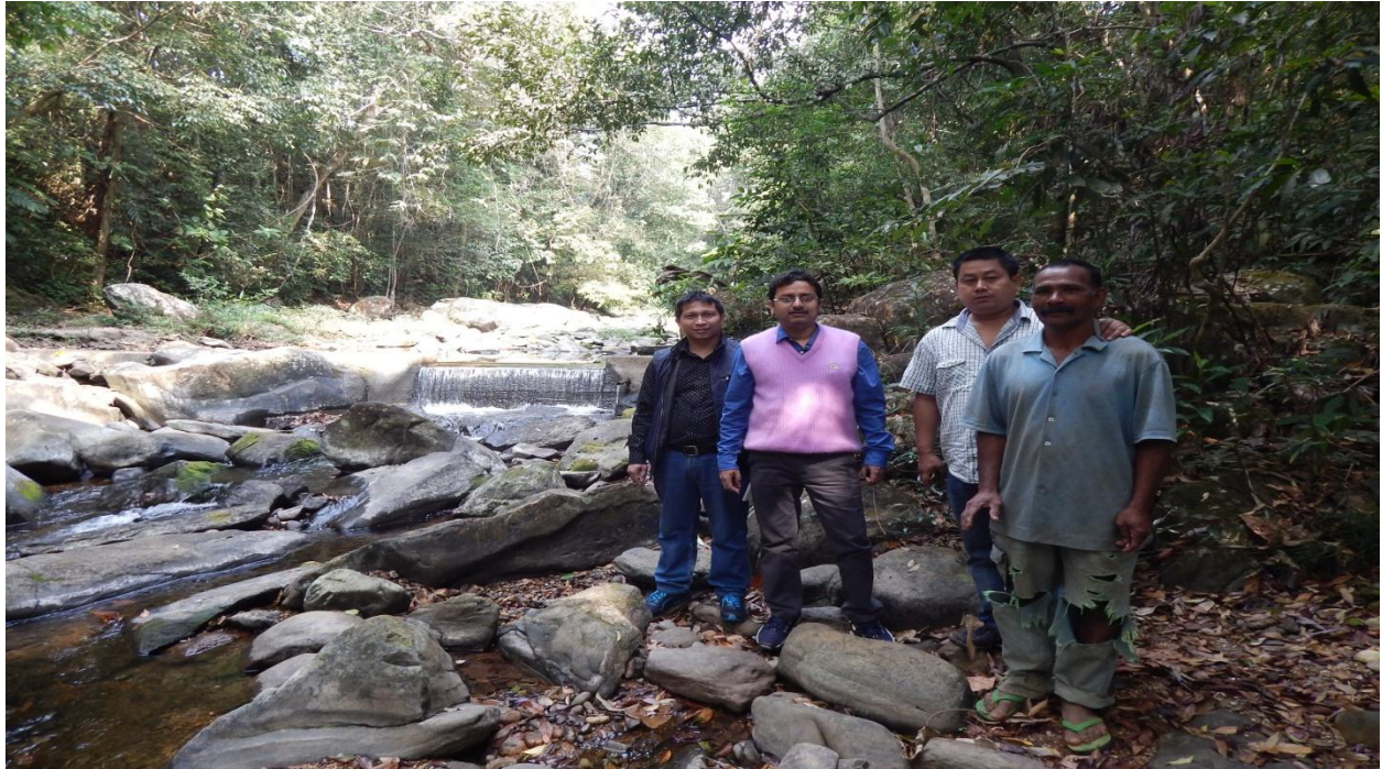
Inspection team in front of the core wall filled dam for water harnessing