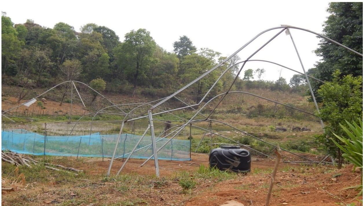
Damaged greenhouse at the Rongchek Chambugong village