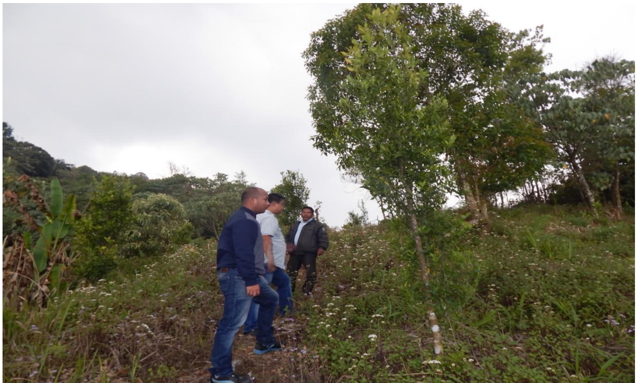
View of orange trees cultivated by the beneficiaries