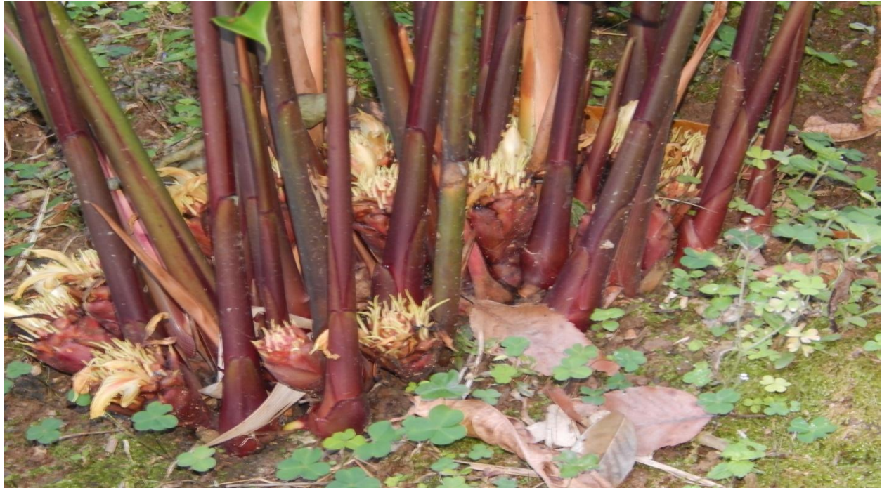
View of cardamom bud coming out of the trees