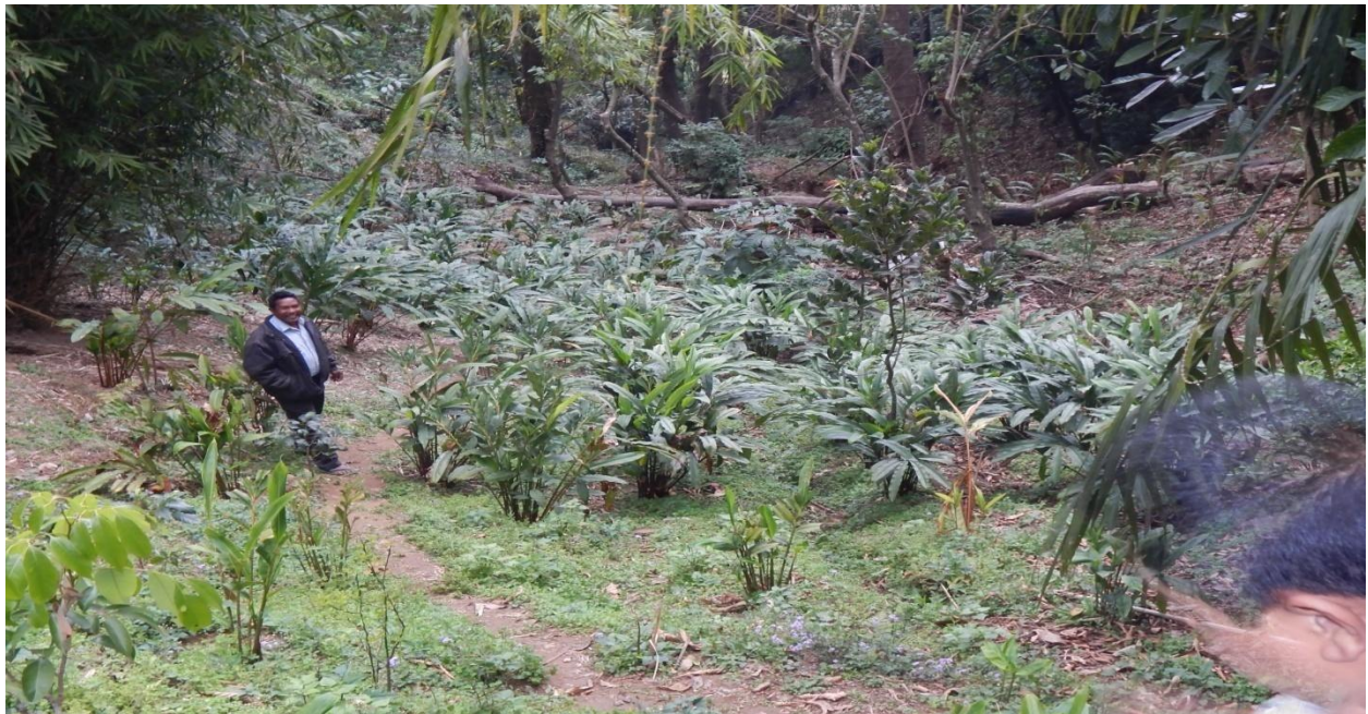
View of cardamom trees cultivated by the beneficiaries