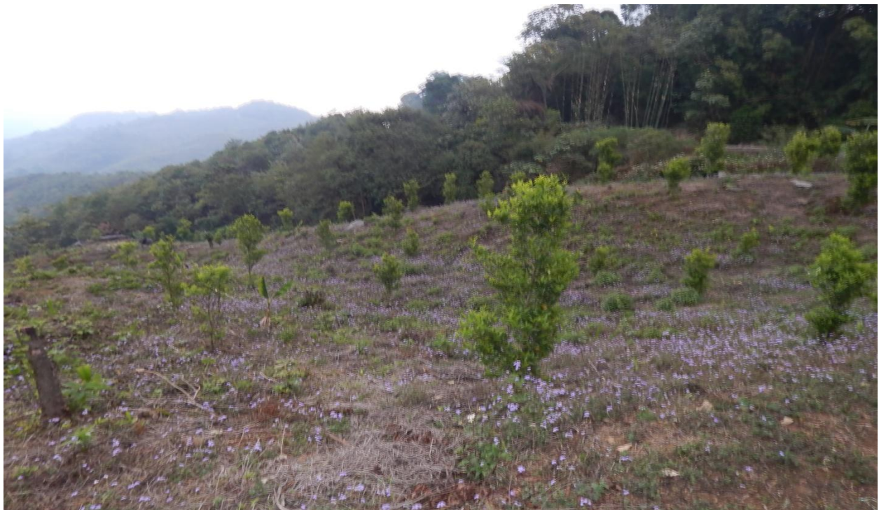
View of Orange Trees