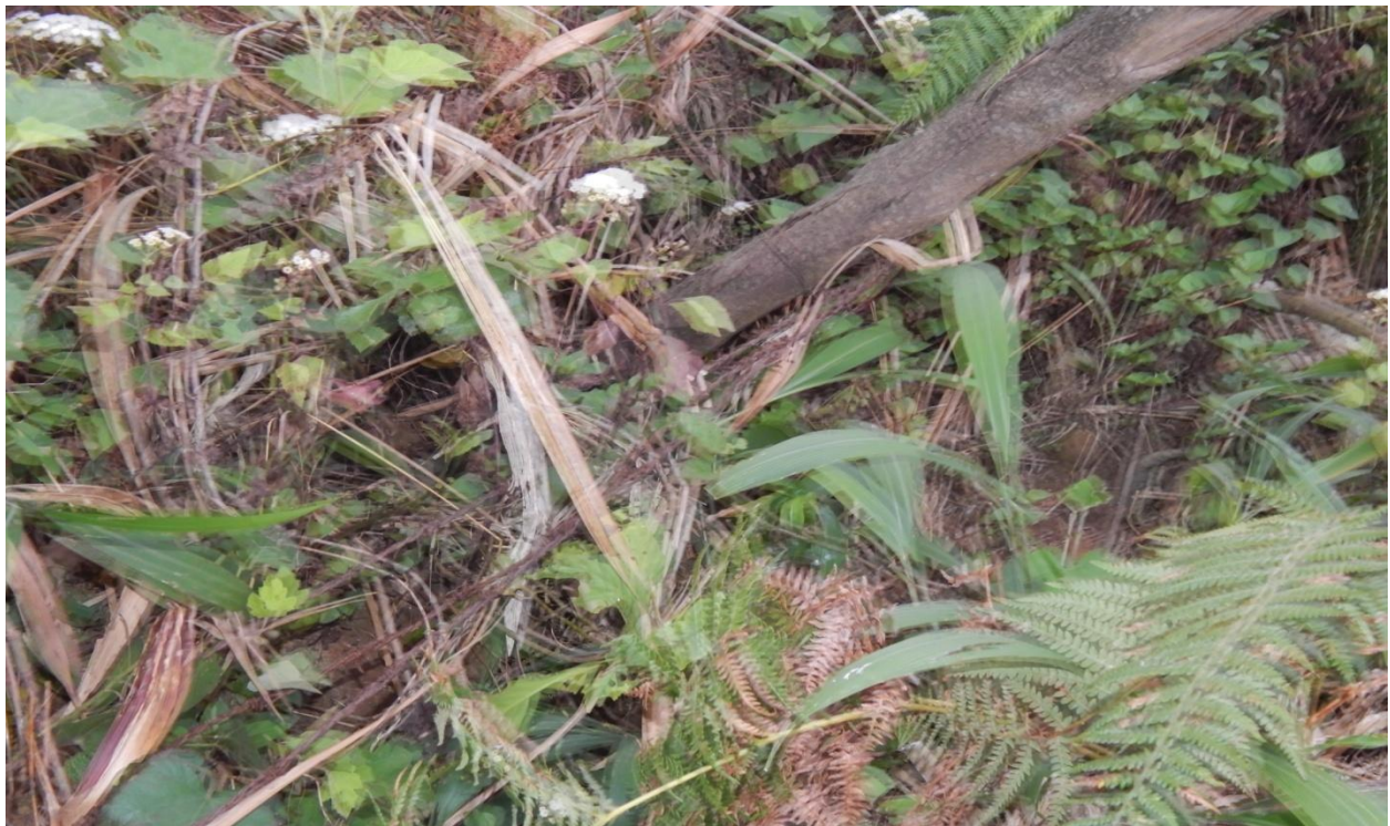
View of Barbwire fencing damage