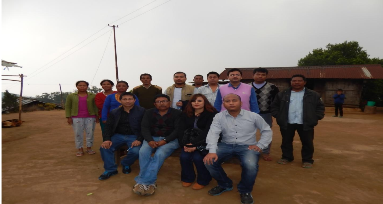
Inspection team with the implementing agency officials and beneficiaries