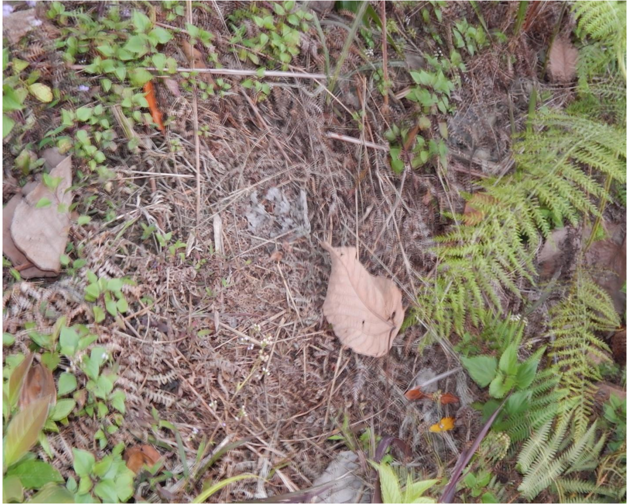
View of Wild Elephant Footprint as shown by Implementing Department