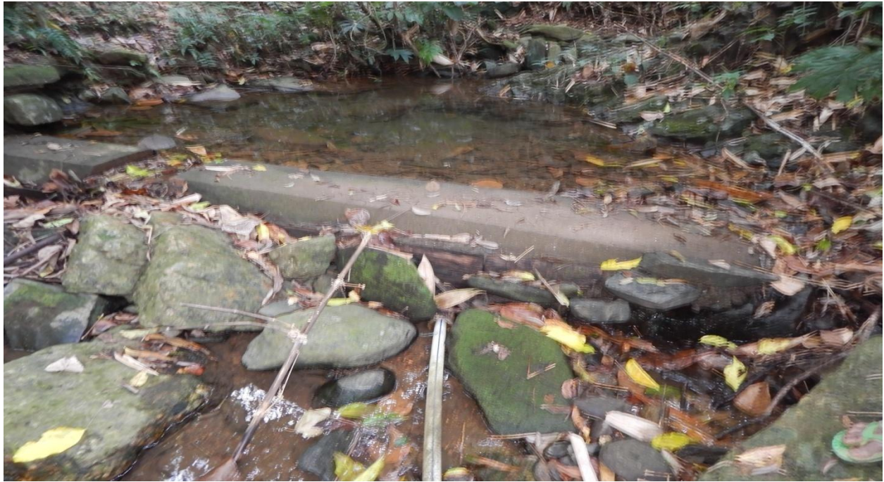
View of irrigation system implemented by the implementing agency