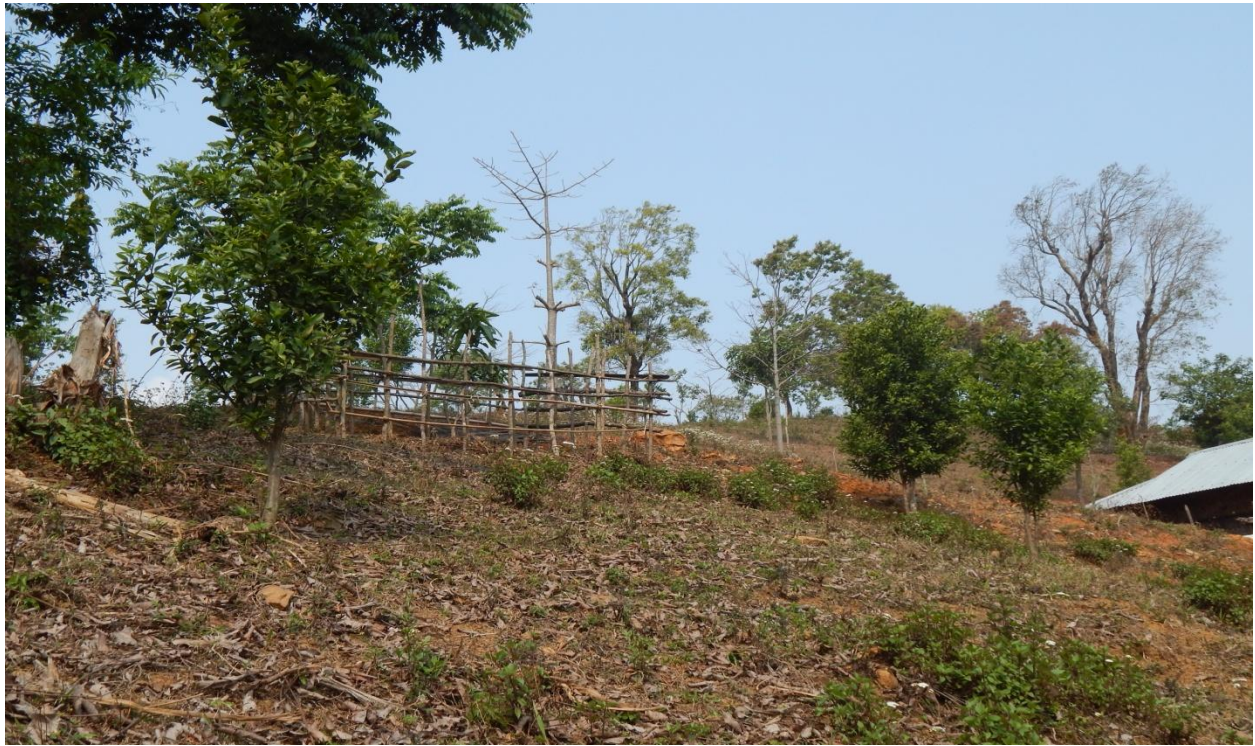
View of orange trees cultivated by the beneficiaries