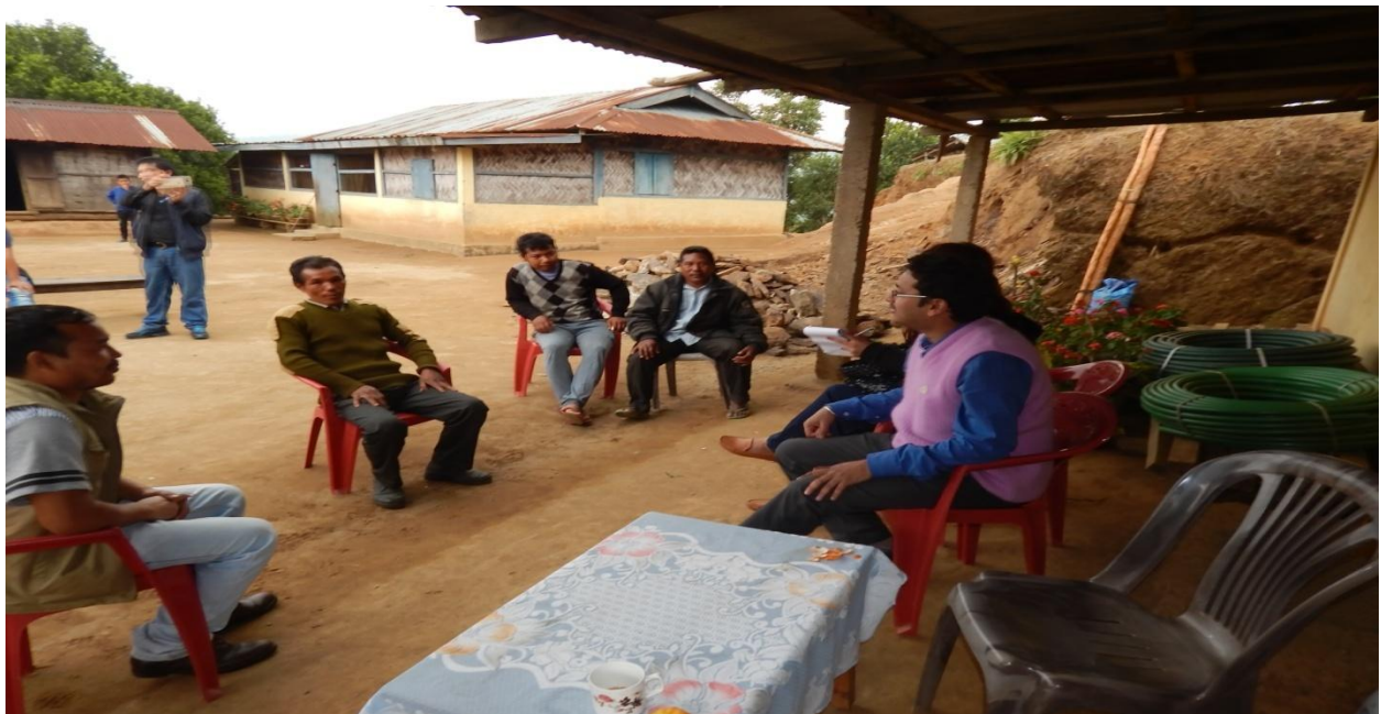
Inspection team interacting with the beneficiaries