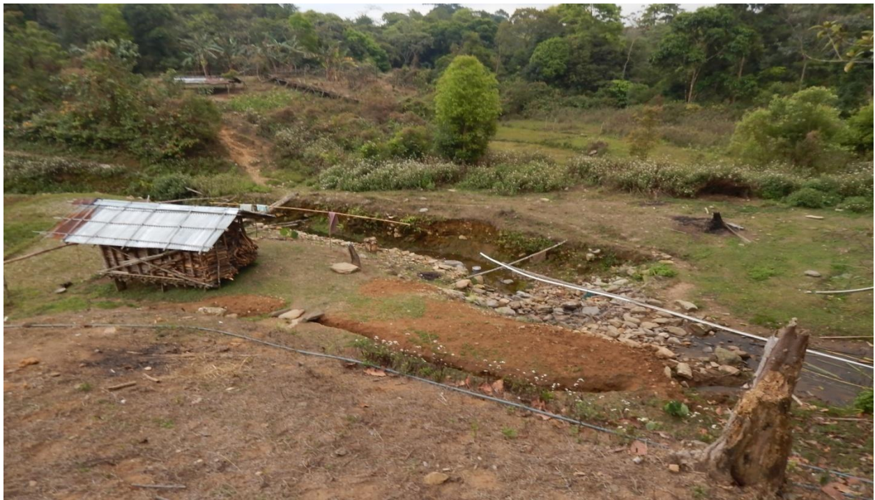
View of paddy field benefitted by the irrigation system