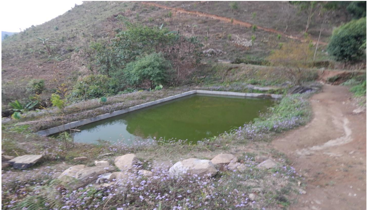
View of Water Harvesting