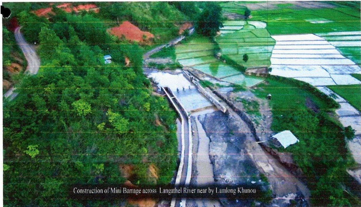
Construction of Mini Barrage across Langathel River near by Lamlong Khunou