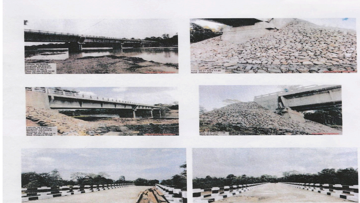
Construction of RCC Bridge No. 3/1 over River Dikhow Chiripuria Ghat along with road from Chiripuria via Ajanpeer Dorgah road to NH 37(Span 159.68 m) in Assam.

Additionally, an inspection was carried out on June, 2025, for the road from NH-515 at Lakhi Nepali to Junakareng via Raying Army Camp , an important 14.08 Km route under NESIDS (Roads) with a project cost of approximately ₹66.84 Crore, benefiting 50 villages and 50,000 people.