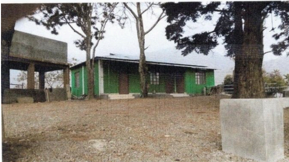
1) Multipurpose building