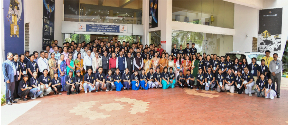
Group photo of students with Dr. V. Narayanan, Secretary, Department of Space/Chairman, ISRO, taken during their visit to ISRO, Bengaluru from April 21 to 24, 2025.

North Eastern Region (MDoNER), the North Eastern Council (NEC), ISRO, North Eastern Space Applications Centre (NESAC), and the respective State Governments of the North Eastern States. The total sanctioned budget is ₹3.83 crore, funded in a 60:40 ratio—₹2.3 crore from NEC and ₹1.53 crore collectively from the State Governments (₹19.18 lakh per state).