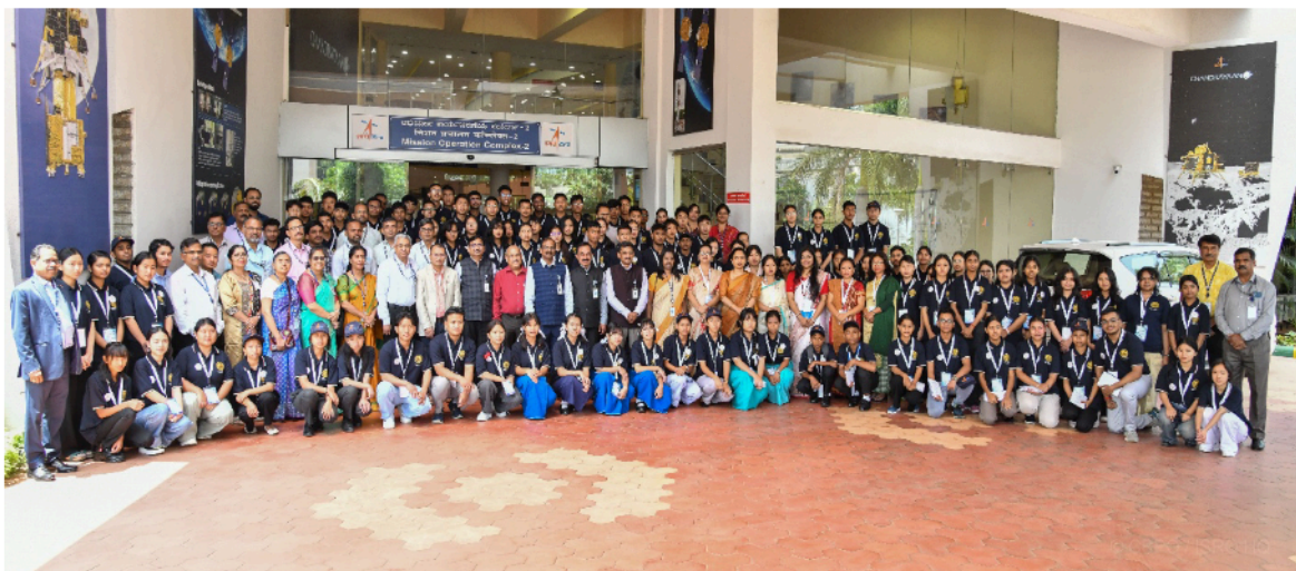
Group photo of students with Dr. V. Narayanan, Secretary, Department of Space/Chairman, ISRO, taken during their visit to ISRO, Bengaluru from April 21 to 24, 2025.