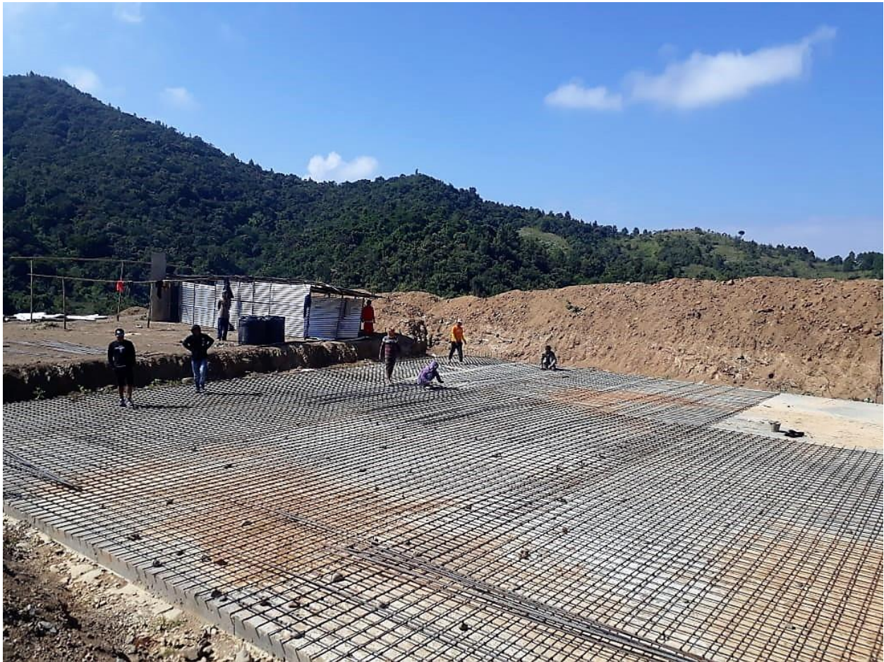
Reinforcement for Base plate of RCC Service Reservoir.