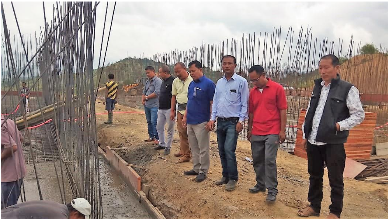
Inspection by Executive Engineer & Superintending Engineer