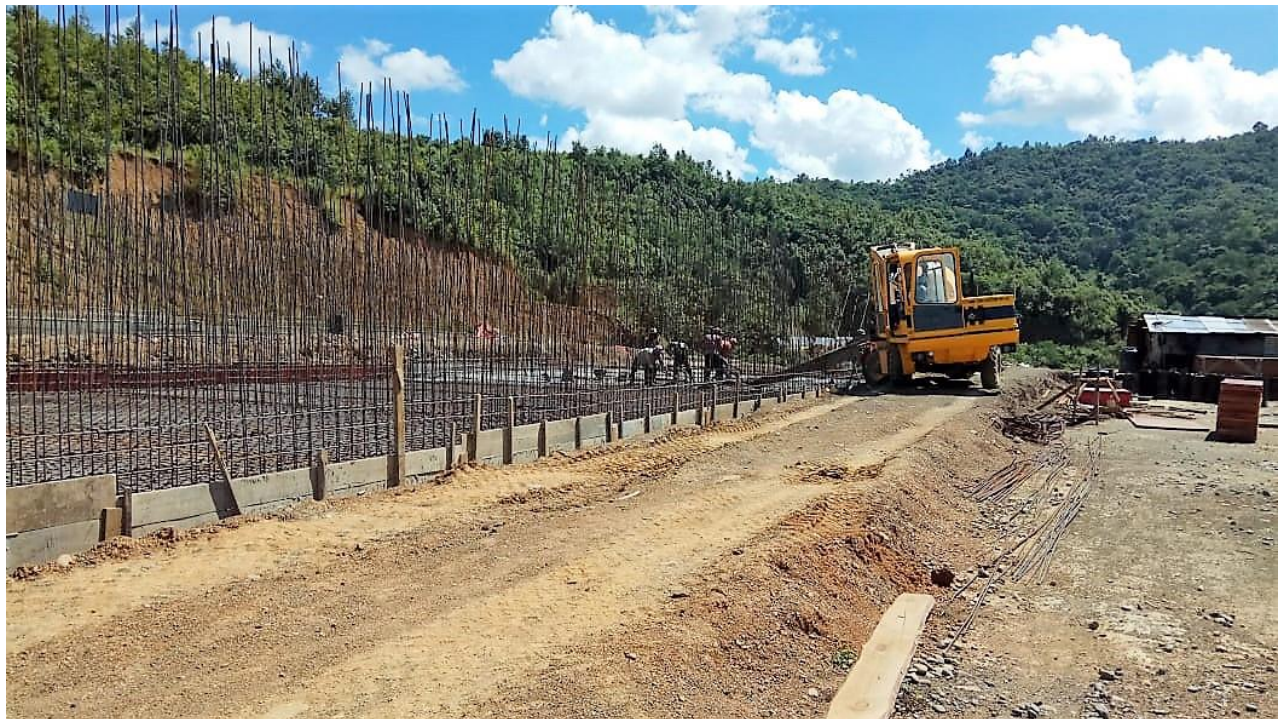
Casting of RCC Slow Sand Filter (RCC Base Plate).