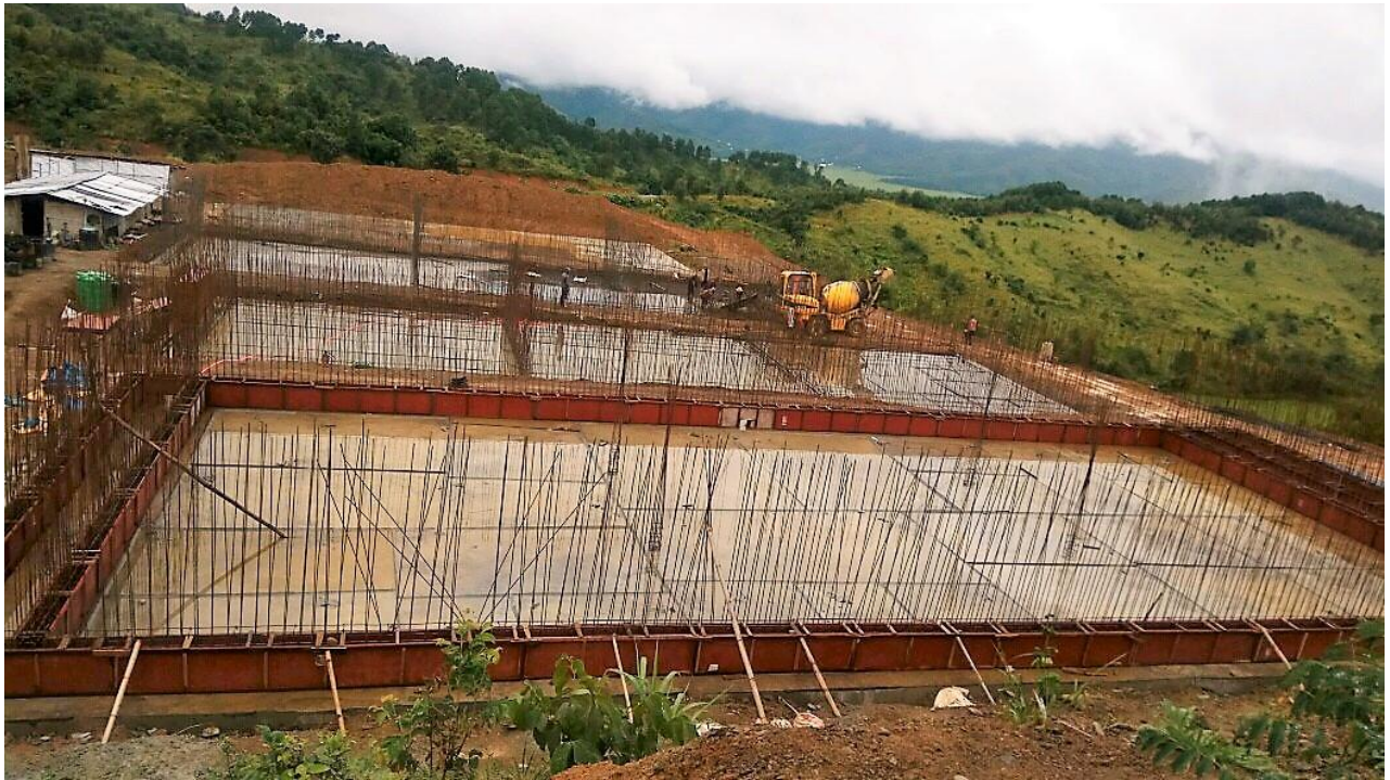
Curing Treatment units.