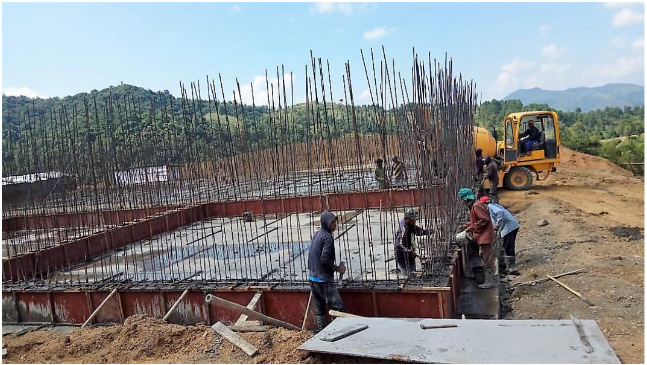
Casting of RCC Slow Sand Filter (RCC Wall).