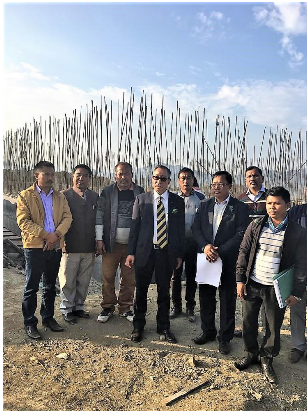
Inspection by Secretary, NEC