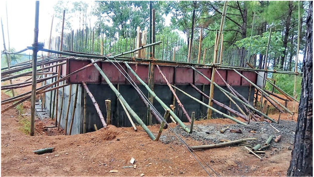
RCC Zonal Reservoir at New Canon.