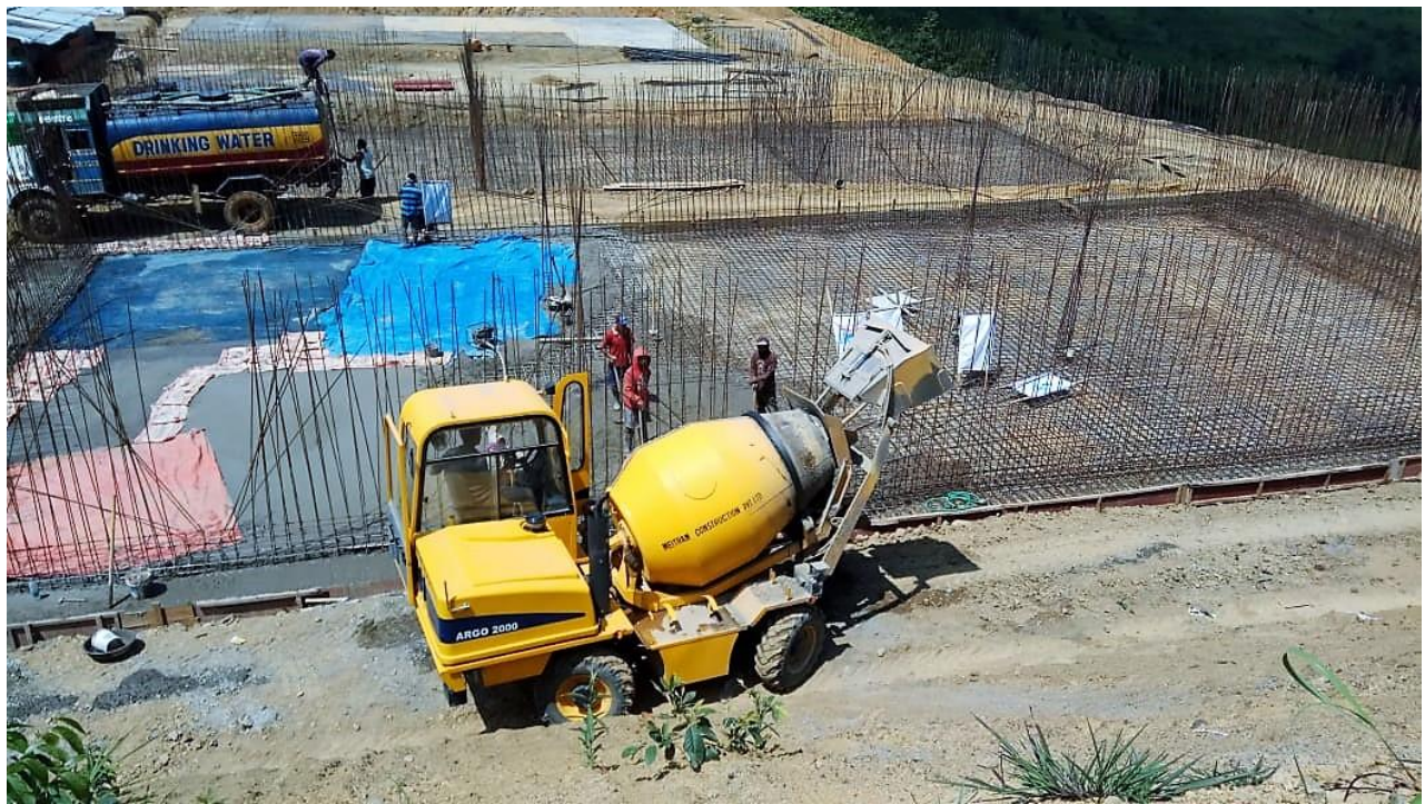
Casting of RCC Settling Tank (RCC Base Plate).