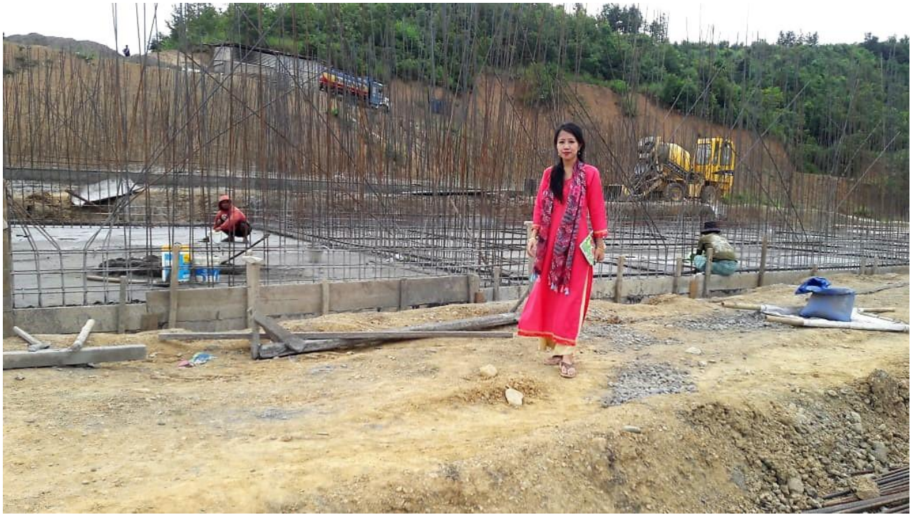
Curing Treatment units.