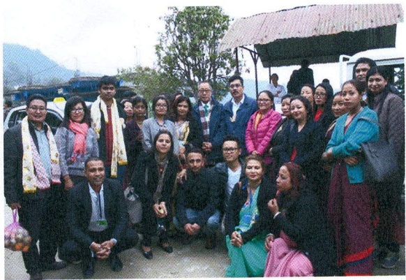
Rural Marketing Shed at Jaubari under Namchi Block, South Sikkim constructed by SHGs of NERLP.