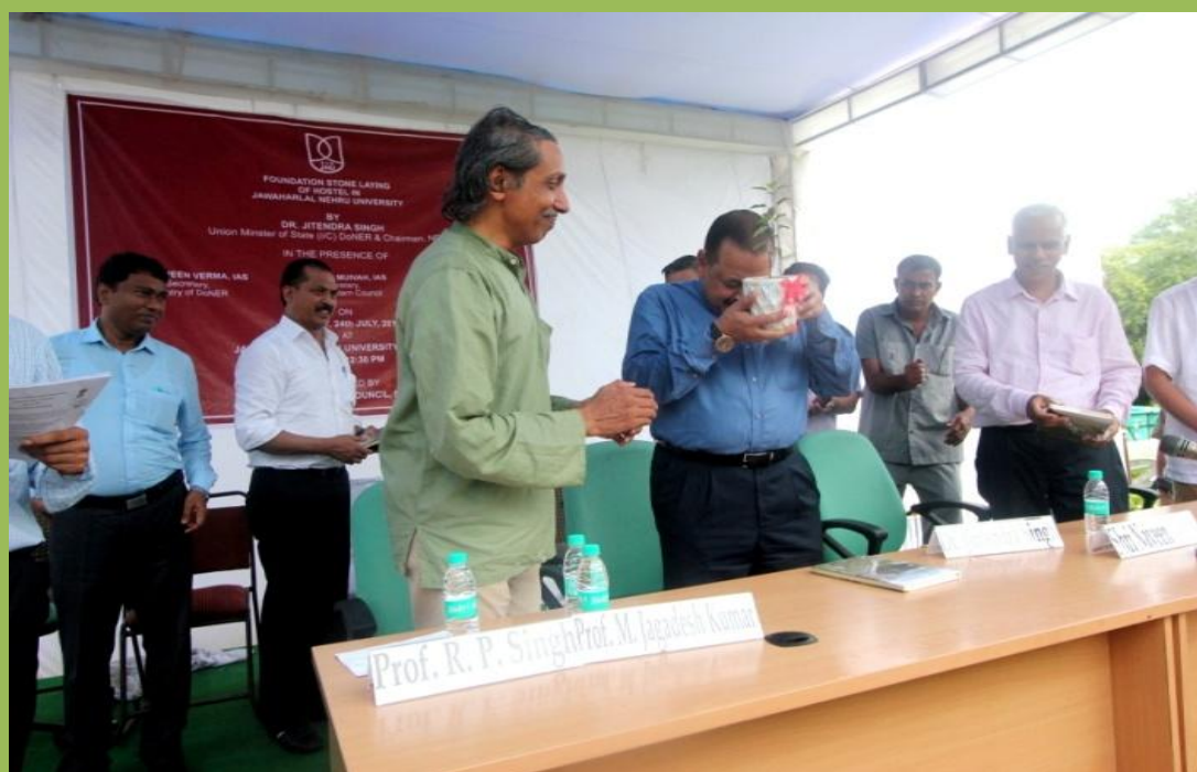
DoNER Minister Shri Jitendra Singh Laid Foundation Stone of Barak Hostel at JNU on 24th July 2017