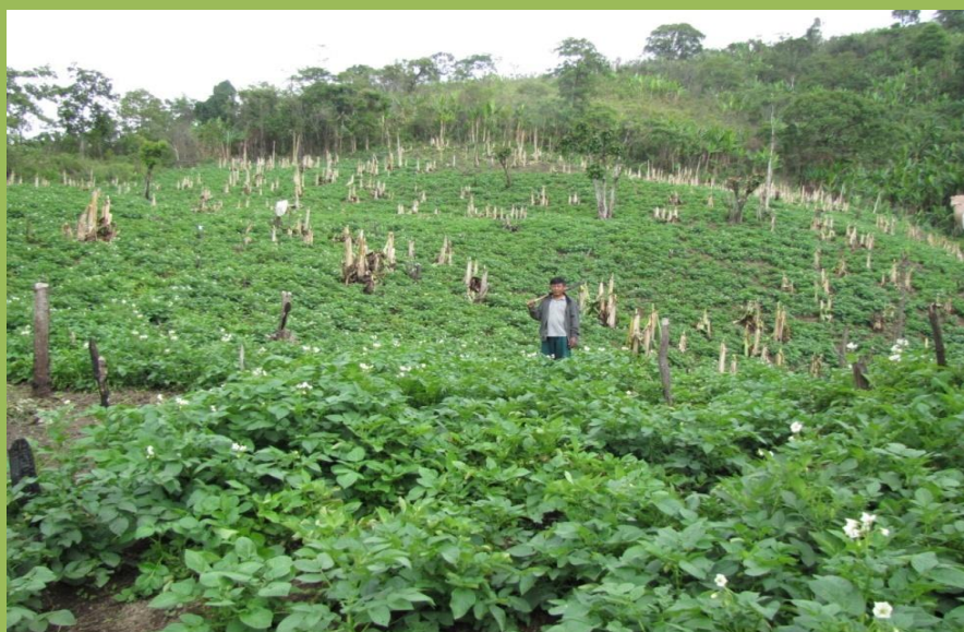
Potato farming in Ukhrul district, Manipur.

NERCORMP operates in four (4) States covering ten (10) Districts viz: Assam (KarbiAnglong and Dima Hasao), Manipur (Ukhrul, Senapati, Chaurachandpur and Chandel), Meghalaya (West Garo Hills and West Khasi Hills) and Arunachal Pradesh (undivided Tirap including Longding and Changlang).