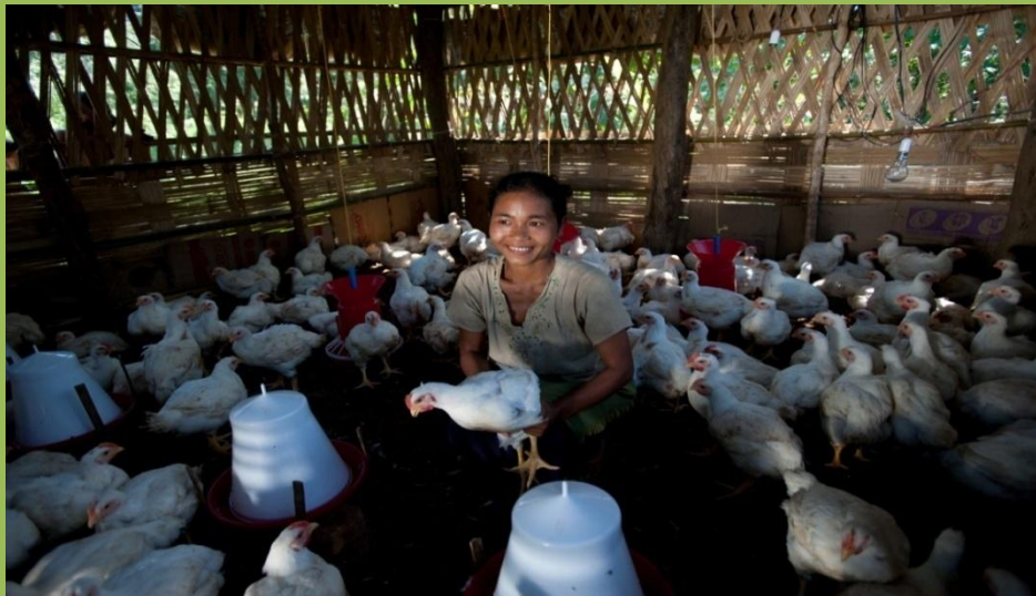
Poultry scheme in Arunachal Pradesh