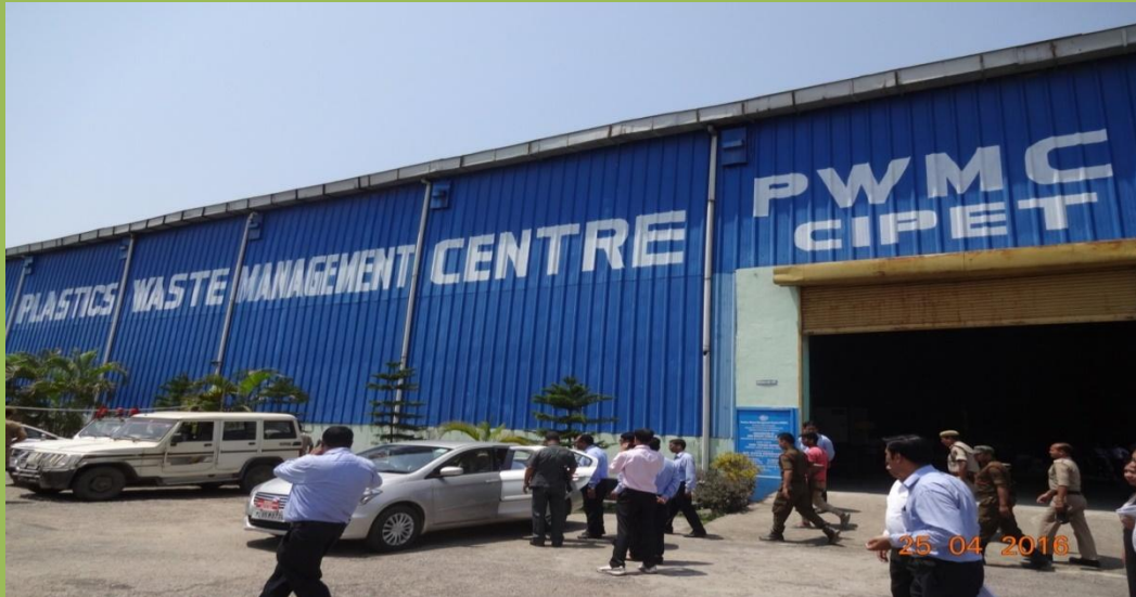
Plastic Waste Management Centre – CIPET, Assam