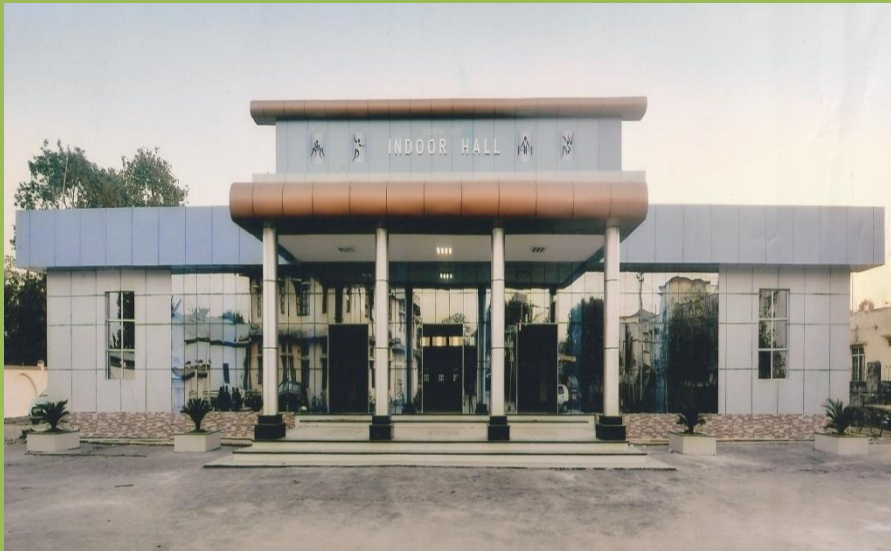
Upgradation of Khuman Lampak Stadium, Imphal