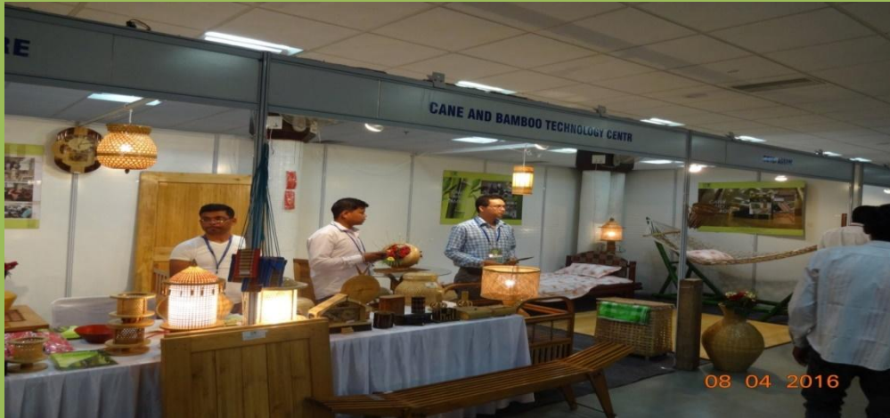
Exhibition stall of CBTC at Home Expo India 2016