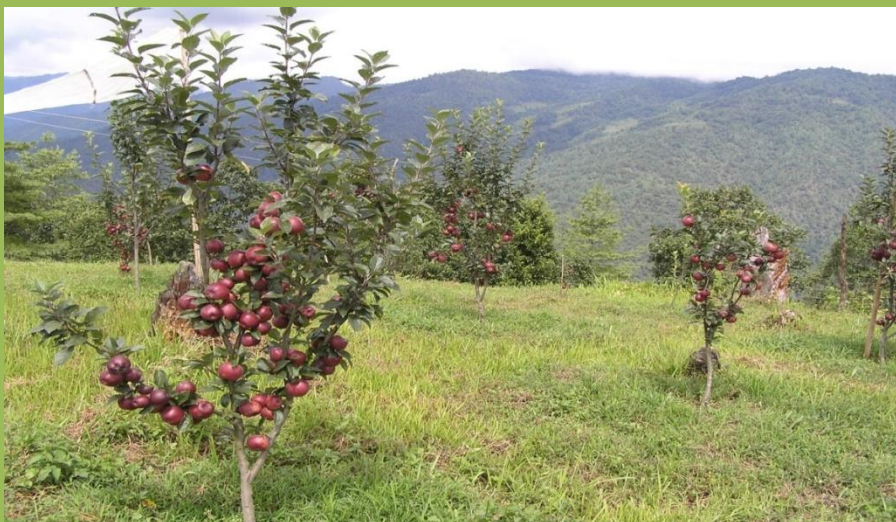
Apple plantation at Zimthung, West Kameng