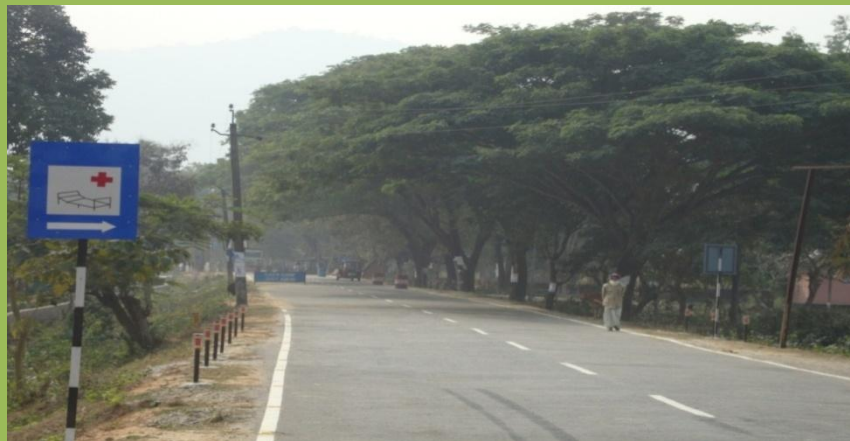
Mairang-Ranigodown-Azra road in Assam