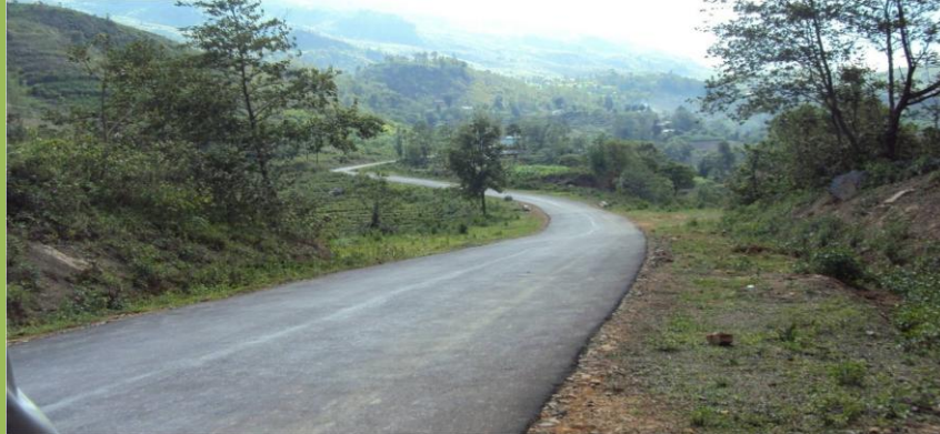
Kangpokpi-Tamei Road 0 – 70.25 km