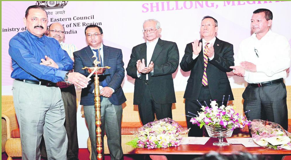
The North Eastern Council (NEC) in collaboration with the Dorbar Shnong, Nongrim Hills was holding the NEC-Pink Cancer Chain Conclave from April 23-29 2016 at the NEC auditorium and at different educational institutions, NEHU and HQ, 101 Area.