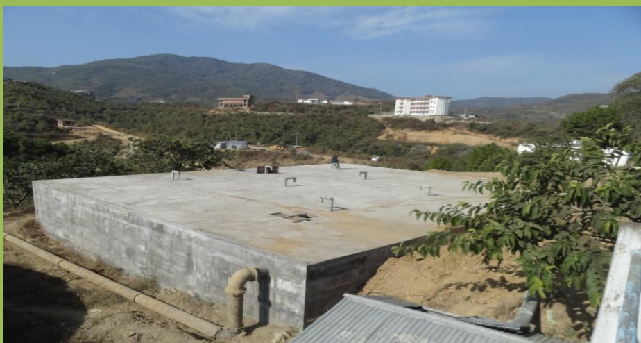
Improvement & Upgradation of water supply scheme for Churachandpur Town, Manipur