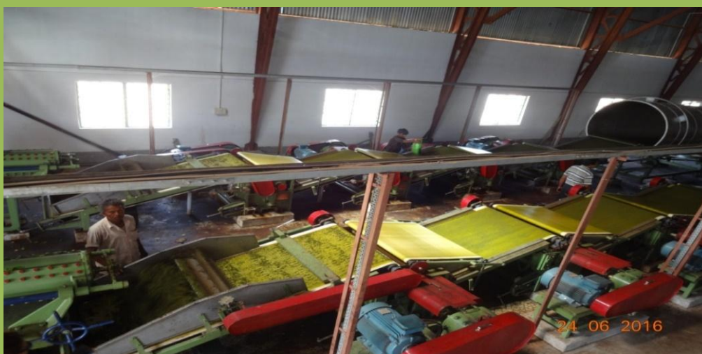
Inside view of Brahmakunda Tea Processing Factory, Tripura