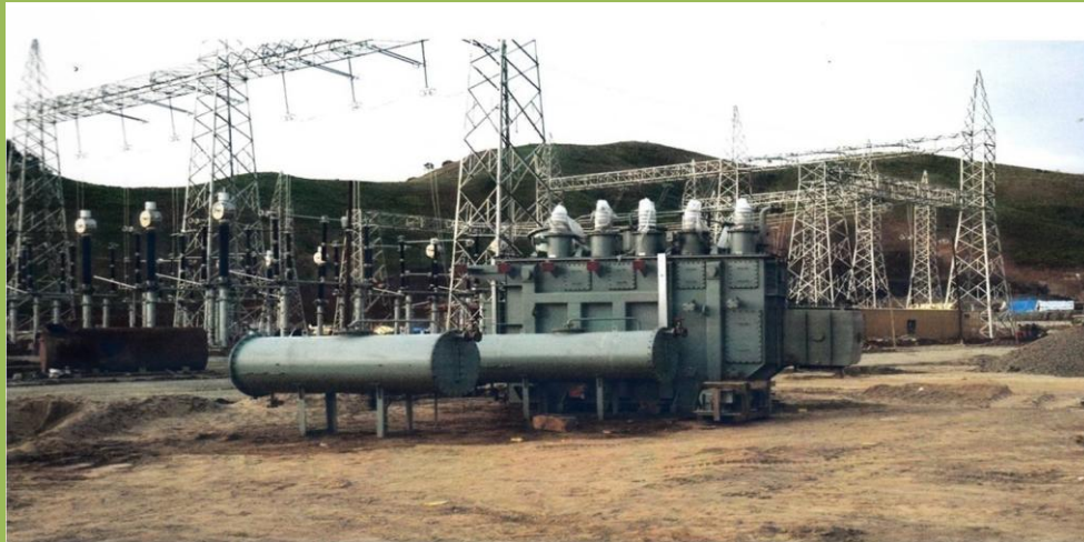
2X20 MVA, 132 KV S/s along with Associated 132 KV lines at Thoubal