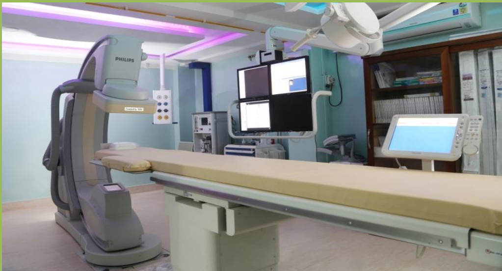
Advanced Medical Devices and Equipment at Sky Hospital, Imphal, Manipur