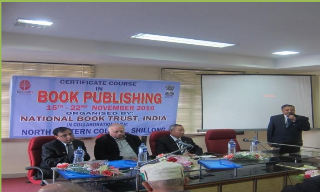
Workshop on Book Publishing by National Book Trust in collaboration with NEC, Shillong held from 15th -22th November 2016