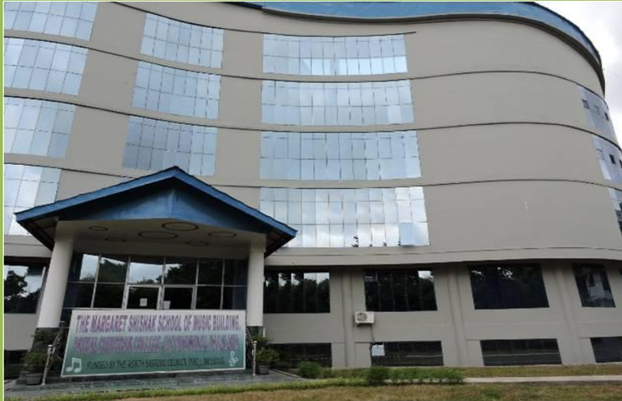
Margaret Shishak School of Music Building at Patkai Christian College, Nagaland