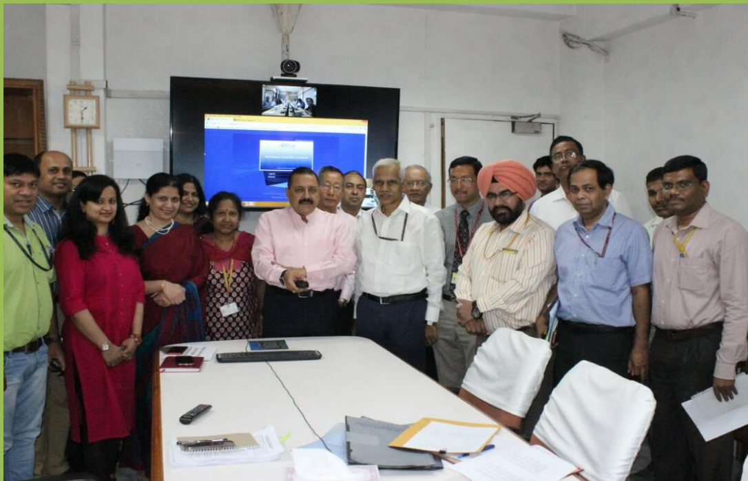
Launch of e-office in the NEC by Shri Jitendra Singh, Chairman, NEC