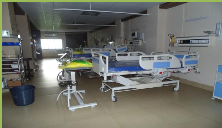
ICU Equipment at Tura Civil Hospital, Meghalaya