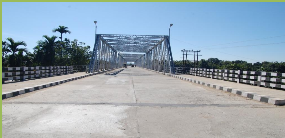
Bridge over river Barak at Fulertal in Assam