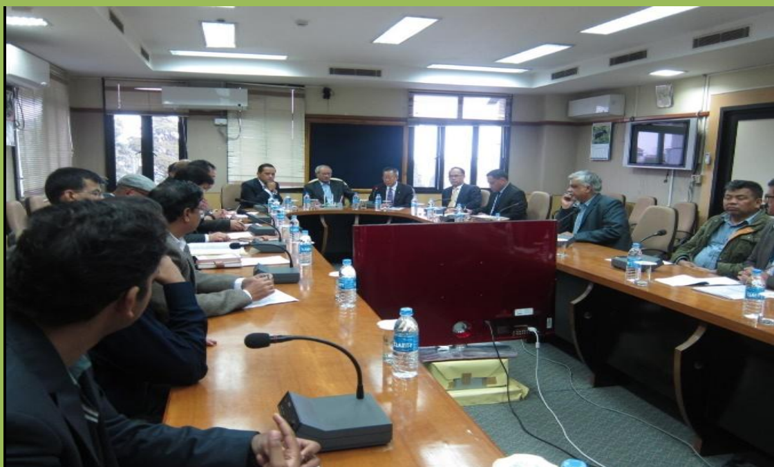
In a meeting on 6 April, 2017, NEC discussed the Regional Plan with various Representatives of Central Ministries