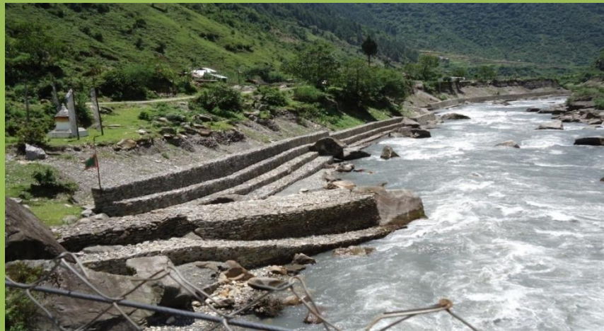
Anti-erosion work at Brokentang and adjoining area in Tawang district, Arunachal Pradesh