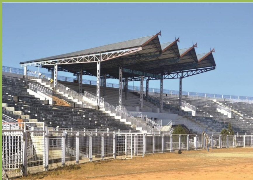
Covered Gallery at IG stadium, Kohima, Nagaland