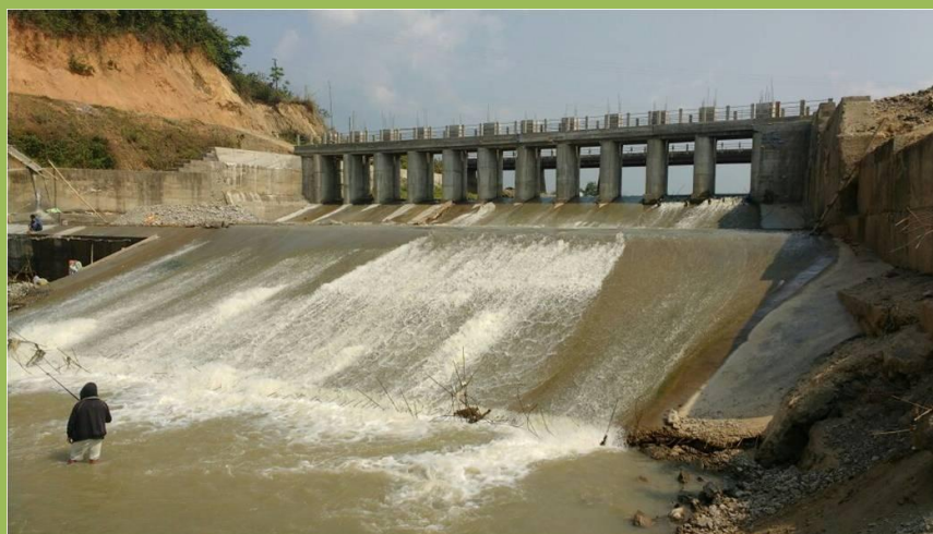
Dam across HeirolLitanMakhong, Thoubal Dist. Manipur