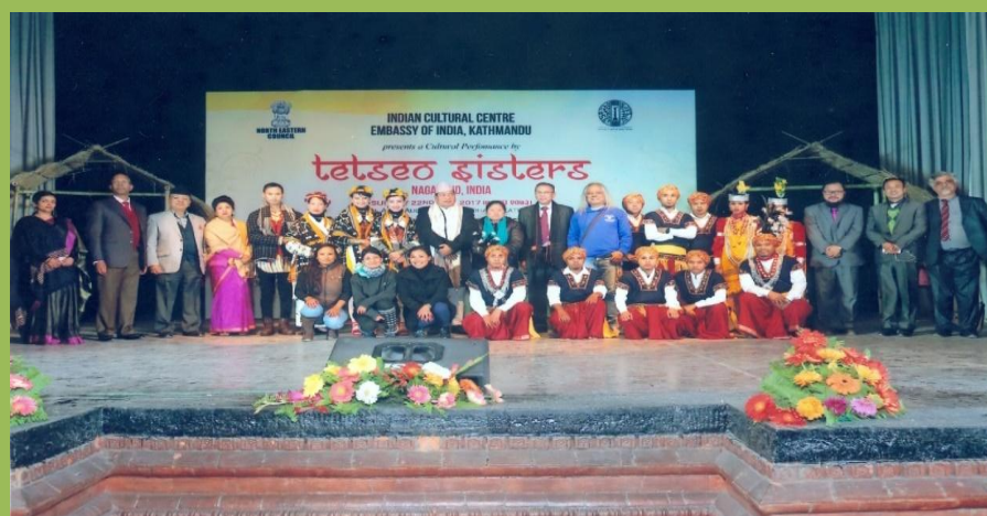
‘Days of North-East Cultural Festival-Namaste Nepal’