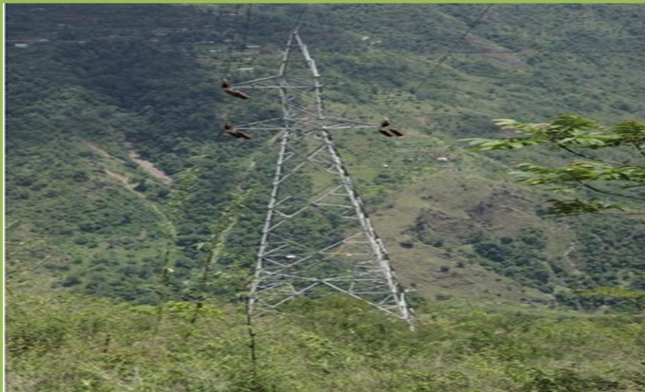
Design, Supply, Erection, Testing, Commissioning of 66 KV S/C Transmission line from 3.3/66 KV S/s of Rongli-I HEP at Sysney in East Sikkim