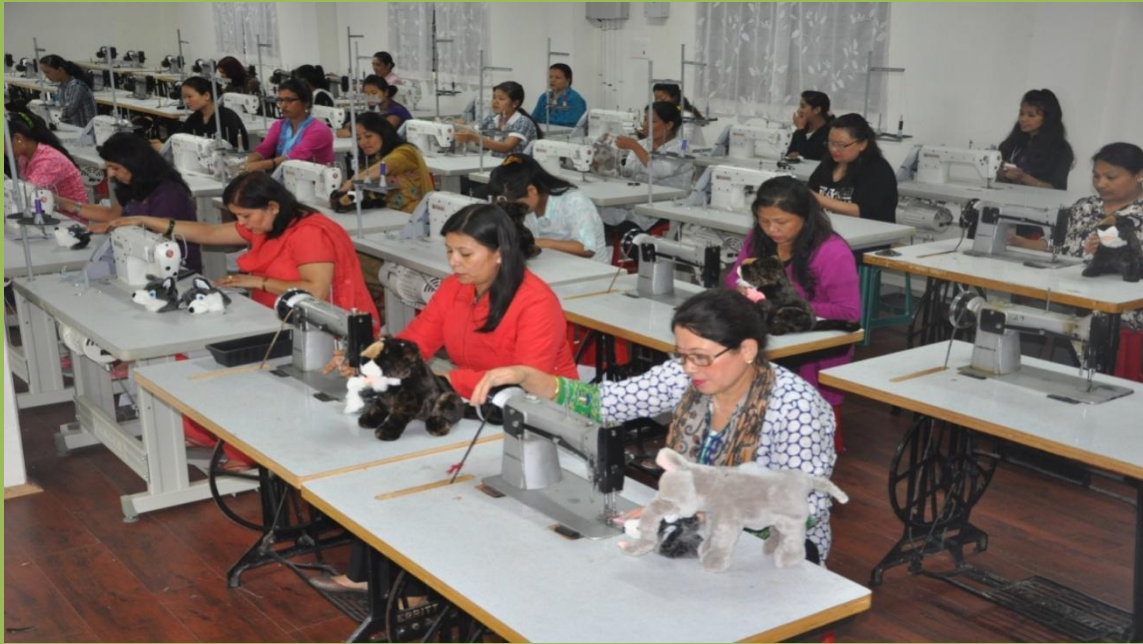
Production and Training Center for Soft Toys at Gangtok, Sikkim