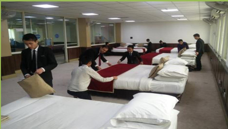
One year training in hospitality & retail sector at World class skill centre, Delhi