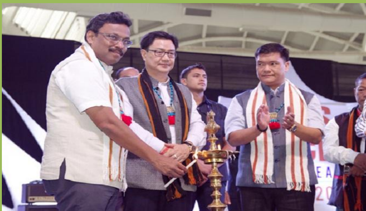
Union Minister of State for Home Affairs of India, Shri Kiren Rijiju attended the Festival of Songs & Dances of Northeast at Vashi, Navi Mumbai held on 27.08.2016