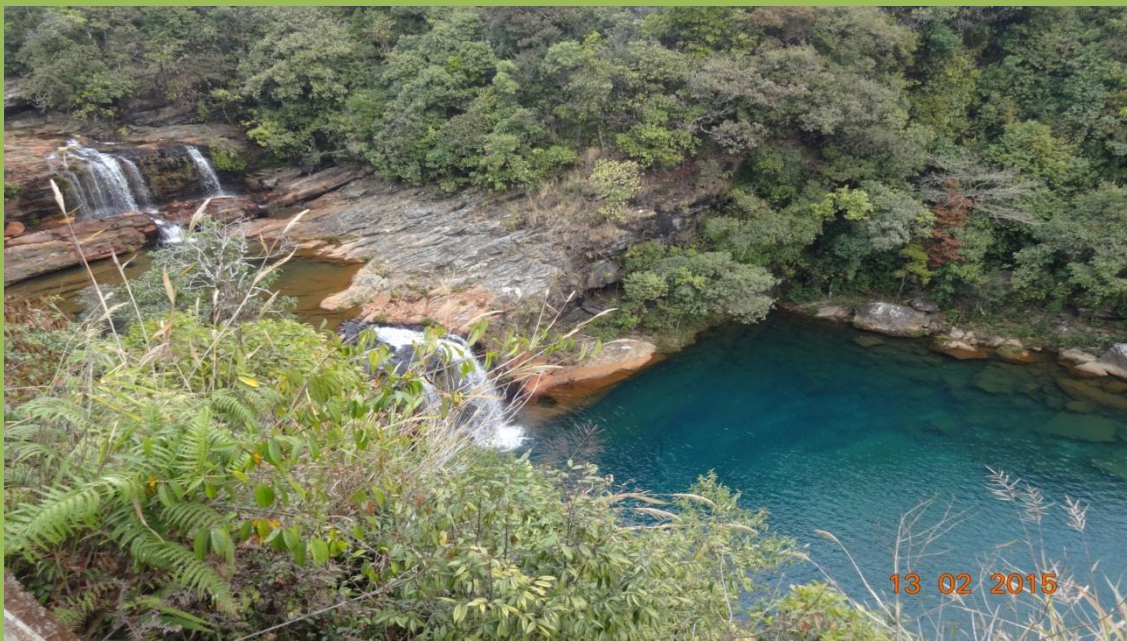
Tourism project at WahRashi, Meghalaya