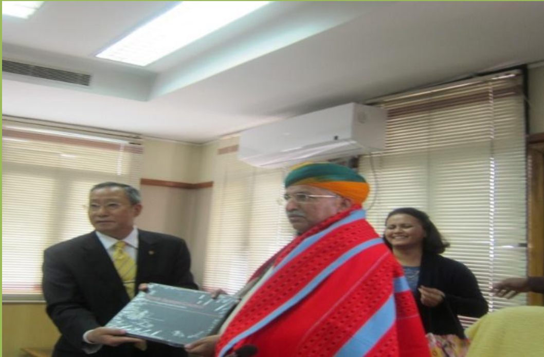
Hon'ble Union Minister of State, Finance & Corporate Affairs Shri Arjun Ram Meghwal visited NEC on 14 November, 2016