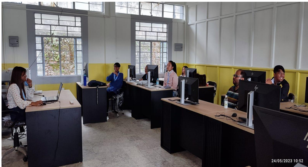
Participants actively engaged in practical sessions aimed at enhancing digital skills for livelihood generation and self-employment opportunities.