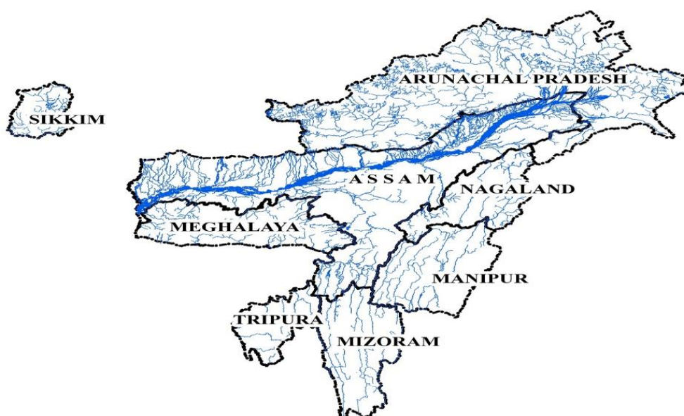
River Network Map of NER