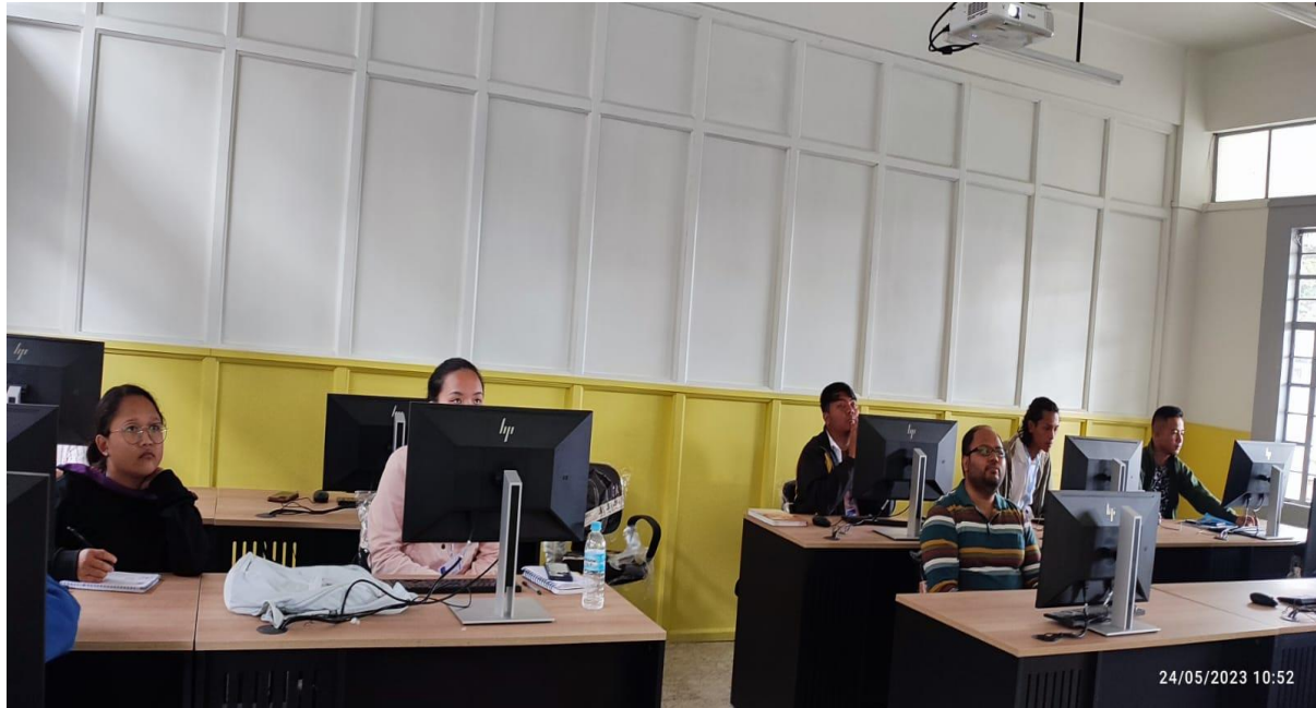
Beneficiaries undergoing hands-on training in digital design and multimedia applications at the Digital Design Lab

Status: Formally closed and completed via OM dated 07-04-2026